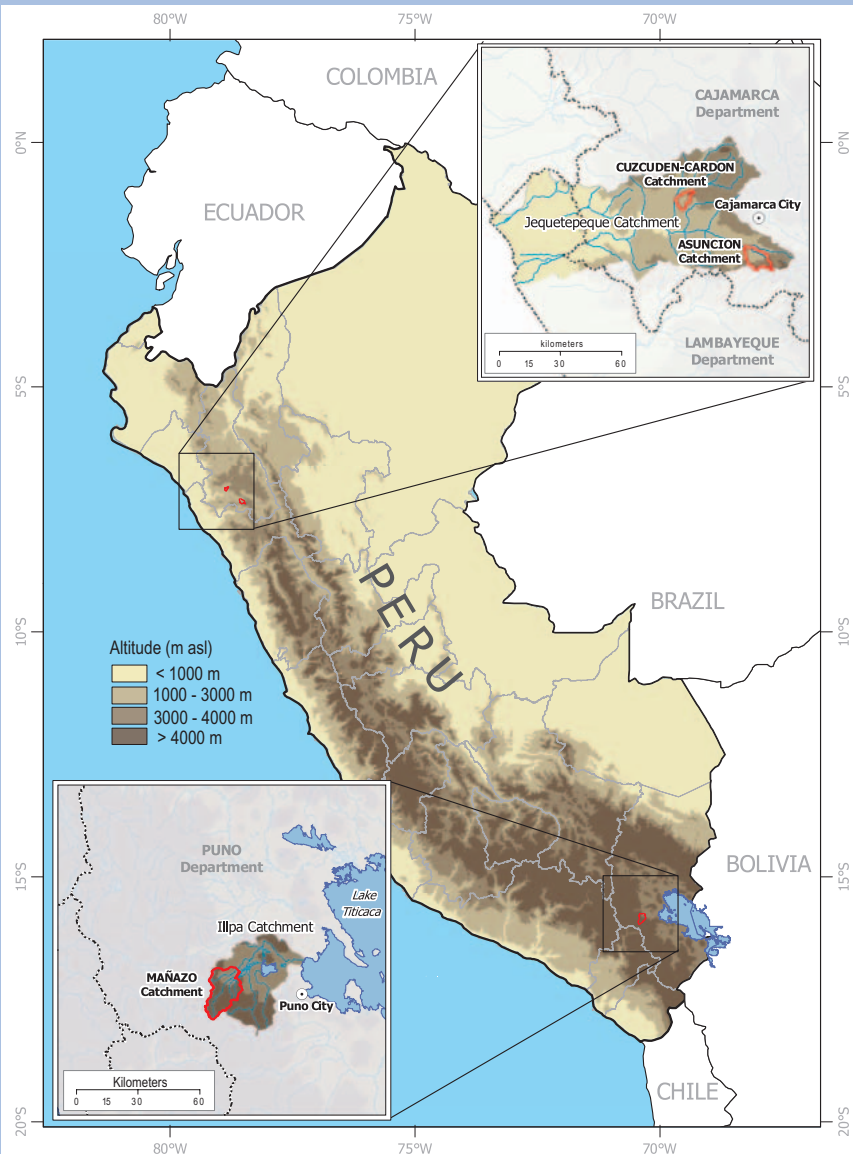
FIGURE 1 The geographic locations of the 3 project catchments in Peru. (Map by Henry Juarez, CIP)

the Peruvian Andes where spatial information played a key role. Can GIS help narrow the gap between professionals and farmers or local officials? Or is it really a top-down tool that requires too much expert knowledge; and are investments too great for remote rural areas? Examples of successful use of GIS are provided in this article, while practical complications and methodological constraints are highlighted.