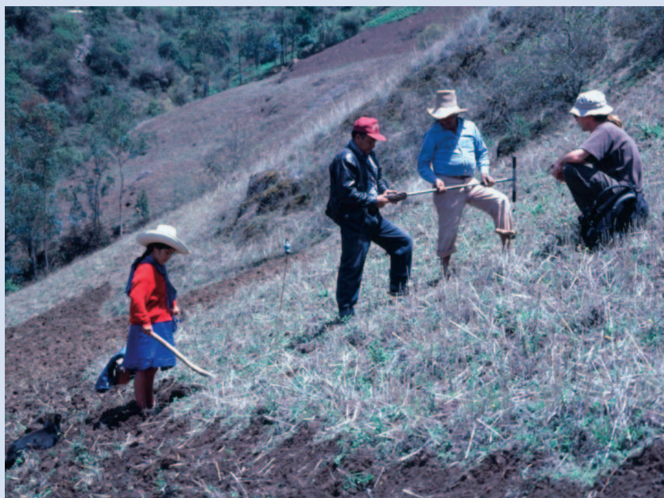
FIGURE 2 Data collection on soils in the Cuzcudén-Cardón catchment.

Mañazo: Because of the high altitudes in the Mañazo catchment, there is not