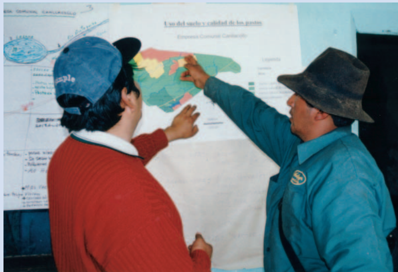
FIGURE 4 A farmer of the Canllocollo community and an NGO facilitator in the Mañazo catchment discuss a land use map.

example, in neighboring countries such as Colombia and Bolivia, decentralization is more advanced, and municipal territorial planning with GIS has been more extensively applied.