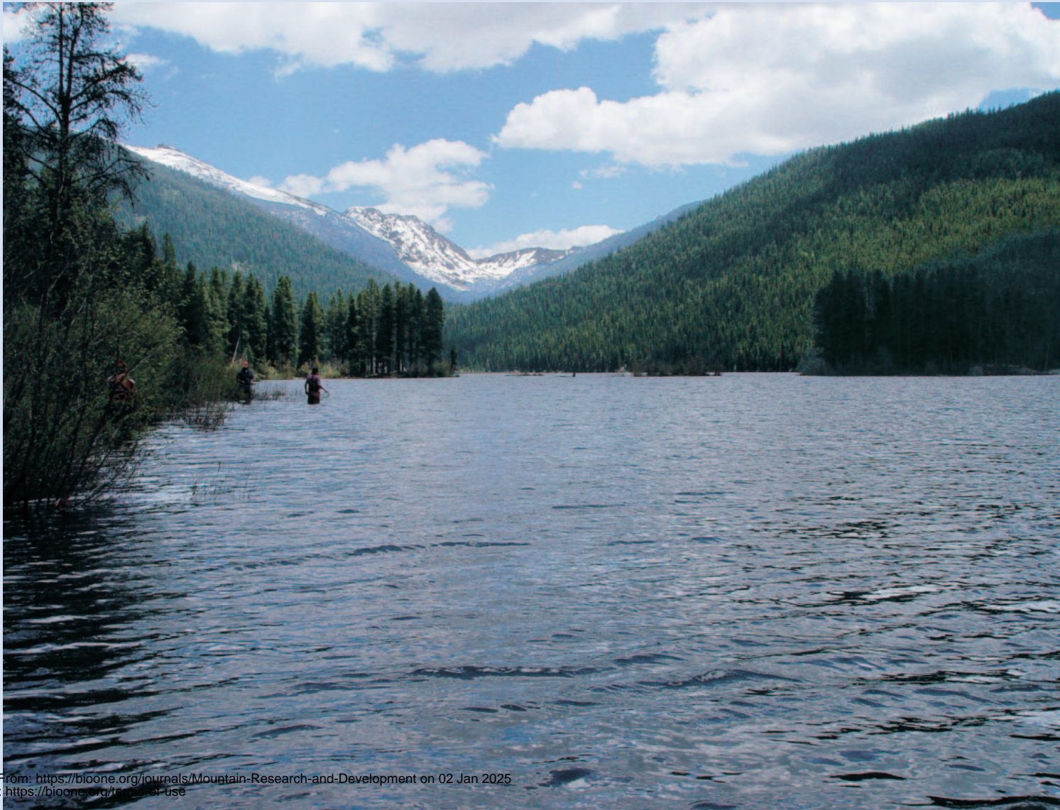
FIGURE 1 Researchers collect freshwater specimens ( Gyraulus parvus and Pisidium casertanum ) at Monarch Lake, west of Rocky Mountain National Park in Colorado.

When collecting new specimens, most researchers are now equipped with handheld Global Positioning System devices and are able to georeference collected data while still in the field (Figure 1). With historical collections data, georeferencing is accomplished retrospectively on the basis of locality information available with most specimens. Typically, initial localities can be located with the assistance of the US Geological Survey's Geographic Names Information System