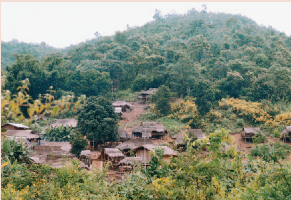
FIGURE 5 The project failed to develop or extend sustainable alternatives for the population's traditional shifting cultivation system. View of Om Koi village, Pae Por.

the forest” was ultimately founded on the threat of the consequences for almost any community or household, were the letter of the law to be enforced.