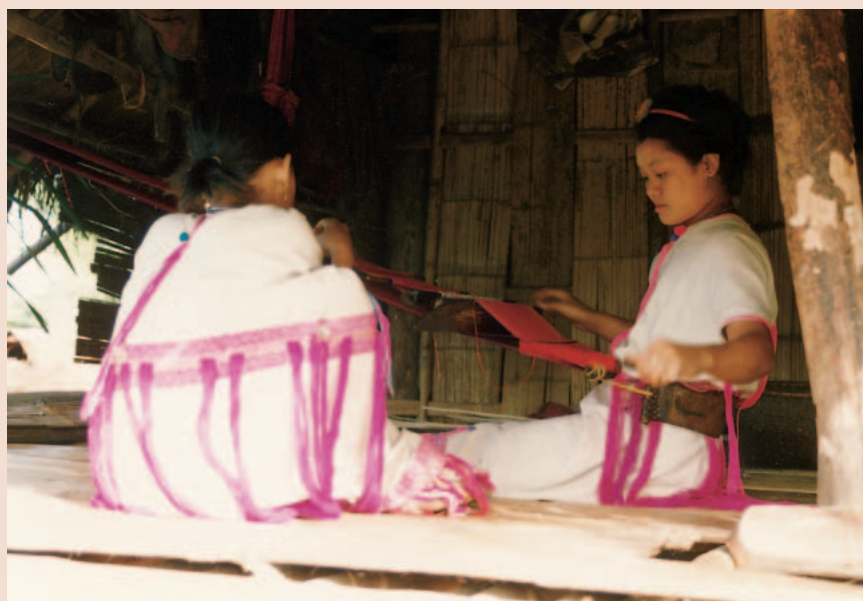
FIGURE 3 Karen women weaving, Tha Song Yang, Pae Por. Neither project paid sufficient attention to traditional economic activities, especially those of women.

ethnic Thais, none speaking any hills language. A range of seeds and some complementary inputs and breeding livestock were distributed, and some temporary increases in production seem likely to have occurred. However, farmers claimed that distribution was arbitrary and inadequate. While new paddy land was to be developed, only 3% of the target of 9000 rai (1440 ha) was met because of limitations of landform and water availability. Although cropping intensities in Wieng Pha were rising and yields falling, little was done to address the need for alternative systems of land management, as the facility's intention to provide research, training and demonstration was never established. The "environmental protection" component in practice consisted of the RFD's reforestation of 1600 ha with Pinus khesia , with villagers participating as laborers. The RFD's policing of land use continued, forcing farmers into practices that they knew to be unsustainable.