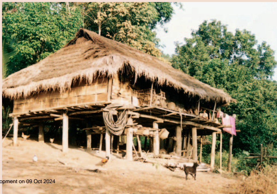
FIGURE 1 A traditional Karen house, Pae Por Highland Development Project.

Both projects aimed to raise the living standards of hill tribe populations by “improving socioeconomic position and self-reliance and progressive integration into the mainstream of Thai society,” as they declared in their project documents. Pae Por Highland Development Project (HDP) was executed by the Department of Local Administration (DOLA) and managed by the 2 District Officers into whose jurisdictions the project fell. At the field level, implementation was centered on 15 “key villages,” each staffed with a 3-person team consisting of a non-formal education