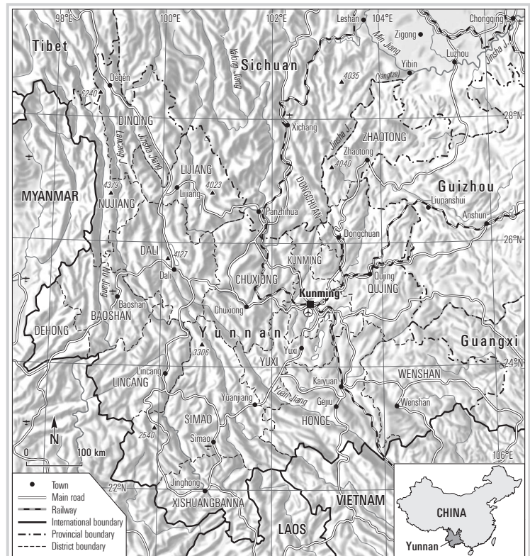
FIGURE 1 Map of Yunnan Province. (Map by Andreas Brodbeck)

The province of Yunnan is situated in southwest China. It covers an area of 394,000 km 2 . It neighbors Guizhou and Guangxi provinces in the east, Sichuan province in the north, and Tibet in the northwest, and has state borders with Myanmar in the west and southwest, as well as Laos and Vietnam in the south (Figure 1). Yunnan is a transition area between south China and the eastern Himalayas. In Yunnan, 3 major Asian climate zones come together: the tropical monsoon zone of South Asia, the subtropical monsoon zone of East Asia, and the Qinghai-Tibetan Plateau zone. This accounts for Yun-