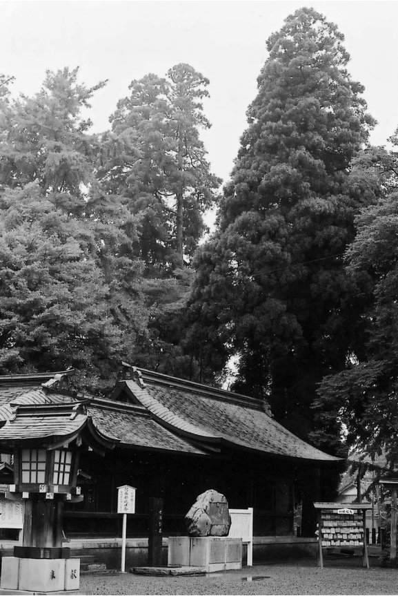
FIGURE 1 Ogatamanoki, Michelia compressa Sarg., at Aso-jingu shrine in Kumamoto prefecture, Japan.

ral environment, they should be protected and conserved as a heritage for citizens.