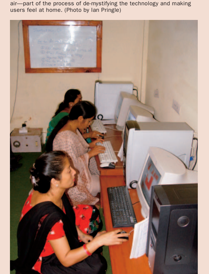
FIGURE 5 Housewives taking a computer course at the CMC in Tansen. Drawing on tradition and saving on furniture costs, the CMC set up computers on low tables so that users could sit on cushions on the floor. The arrangement helps to give the center a less formal

The CMC is introducing a membership system through which community members and volunteers are able to use the computer and Internet facilities. The team plans to expand the hours of cablecast programming to increase viewership and hopefully community support. The Local Programme has started to carry some small advertising with spots made by youth volunteers. The CMC offers paid video and production services for local weddings and other ceremonies. Youth who do the video shooting split the NPR 2000 fee (about USD 25) with the center. The CMC charges NPR 750 to mix wedding video footage. The center has started to offer limited, low-cost training programs. For example, 30 housewives are paying an average of NPR 900 (about USD 12) for a three-month course covering basic computers, word processing and Internet (Figure 5). The CMC is also planning to introduce on-demand music and video features for cable subscribers.