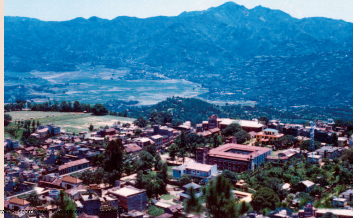
FIGURE 1 The center of Tansen town photographed from Shreenagar Park on the rim of the Madi valley. The CMC is located on the main bazaar road, which runs from the lower left to the center of the photo.

Historically a regional center, like many hill towns in the Himalayan belt Tansen is increasingly isolated from the plains where growth, trade and mobility are higher (Figure 1). Palpa also faces the pressures of migrating labor and instabili-