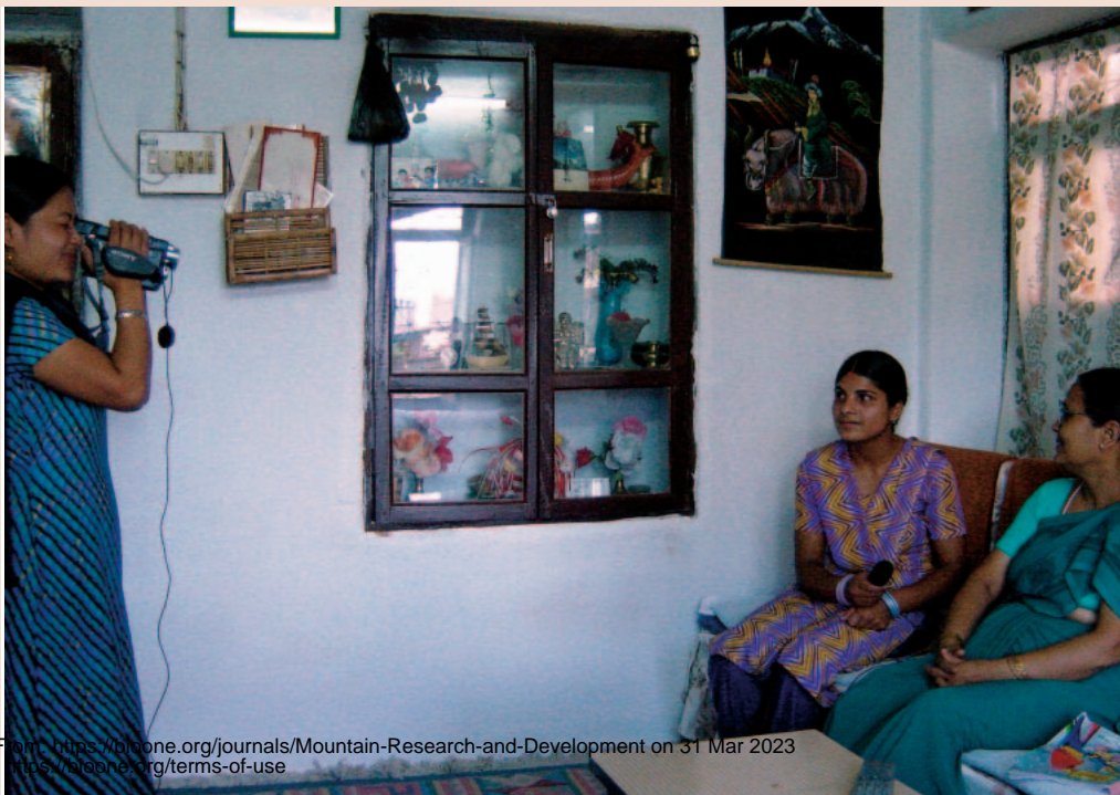
FIGURE 4 Two young producers film and conduct an interview as part of Jeevanko Goreto (Path of Life). The CMC's focus is on youth, and young women constituted a majority of the 174 participants that the CMC trained in the first year of the program.

Direct access to the Internet is also opening up new ideas and spaces for exploration. After a computer training program for 30 housewives, a handful of women have started using email to keep in touch with family members abroad. They also search the Internet for new recipes and hair styles to put to use in small businesses. To address the lack of good materials available in masters-level programs, the CMC is introducing a specialized course for local campus lecturers on searching and using the Internet.