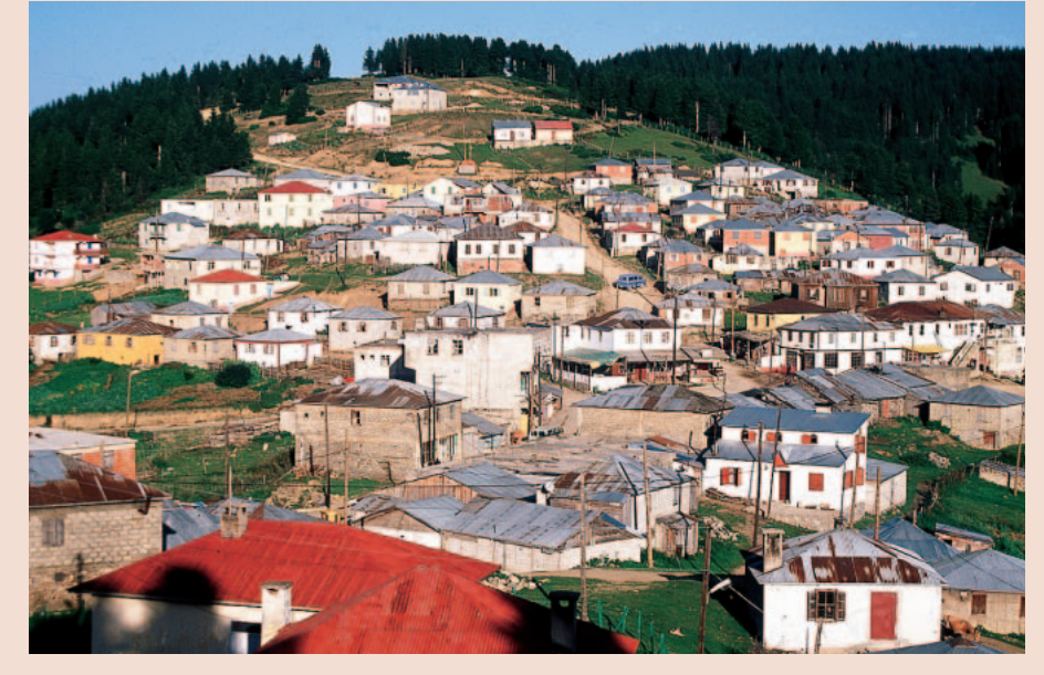
FIGURE 2 Although Turkish law only allows the building of temporary dwellings in the highlands, an increasing number of permanent homes have been constructed, using non-traditional material and architecture. The village of Kumbet in the Black Sea region.

tors. The chance to experience traditional highland culture and its pristine environment has drawn many people, and a new kind of "highland tourism" has enabled many visitors to participate in this fascinating way of life. However, intense construction and development resulting from this opportunity is interfering with traditional utilization of highlands.