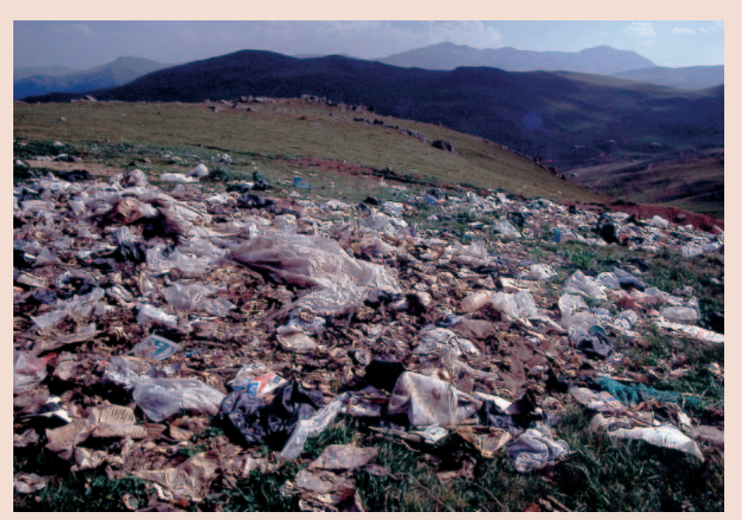
FIGURE 4 Litter remaining after the festival: a heavy burden on the environment.

demand for local tourism activities, highland festivals began to attract intense interest. Highland festivals, held by a limited number of local people who walk from their villages to perform traditional dances, now attract tens of thousands of people who travel for great distances, from different cities and countries. As a result, thousands of vehicles pile into the festival spaces (Figure 3). Damage done by people and vehicles surpassing the local carrying capacity in a single day is immense. Overcrowding, noise, exhaust emissions, littering (Figure 4), provisional tents and prefabricated huts set up for a day exert too much pressure on the ground, damage the local flora, and disturb local wildlife.