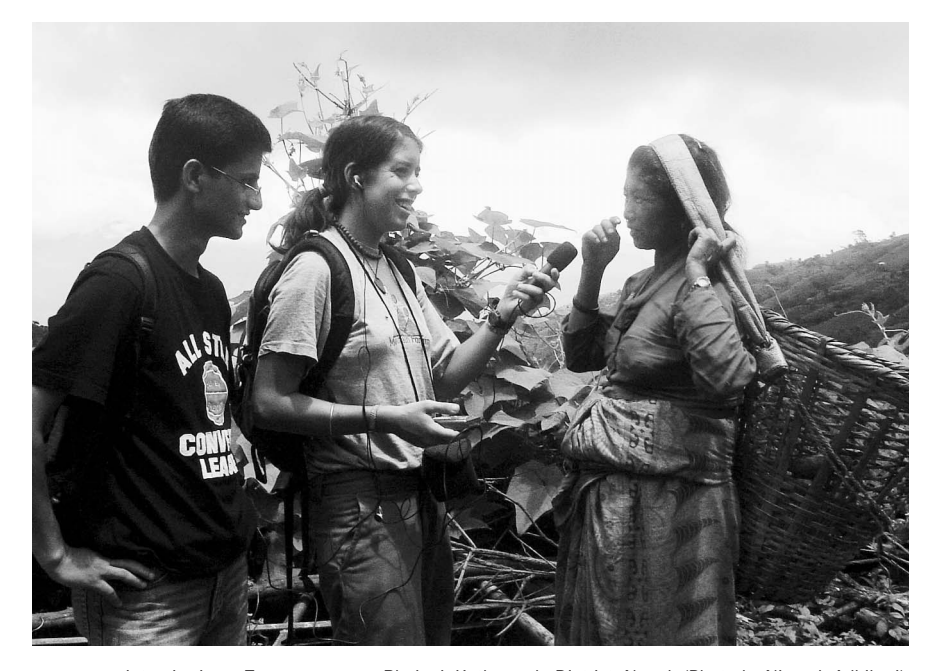
FIGURE 1 Interviewing a Tamang woman. Bhojeni, Kathmandu District, Nepal.

In the first phase, 8 such programs will be produced. As this is a pilot phase, the purpose is to assess whether such an approach—which