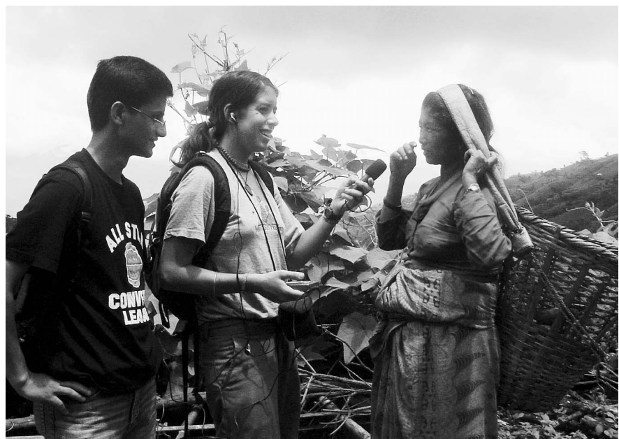
FIGURE 1 Interviewing a Tamang woman. Bhojeni, Kathmandu District, Nepal.

In the first phase, 8 such programs will be produced. As this is a pilot phase, the purpose is to assess whether such an approach—which