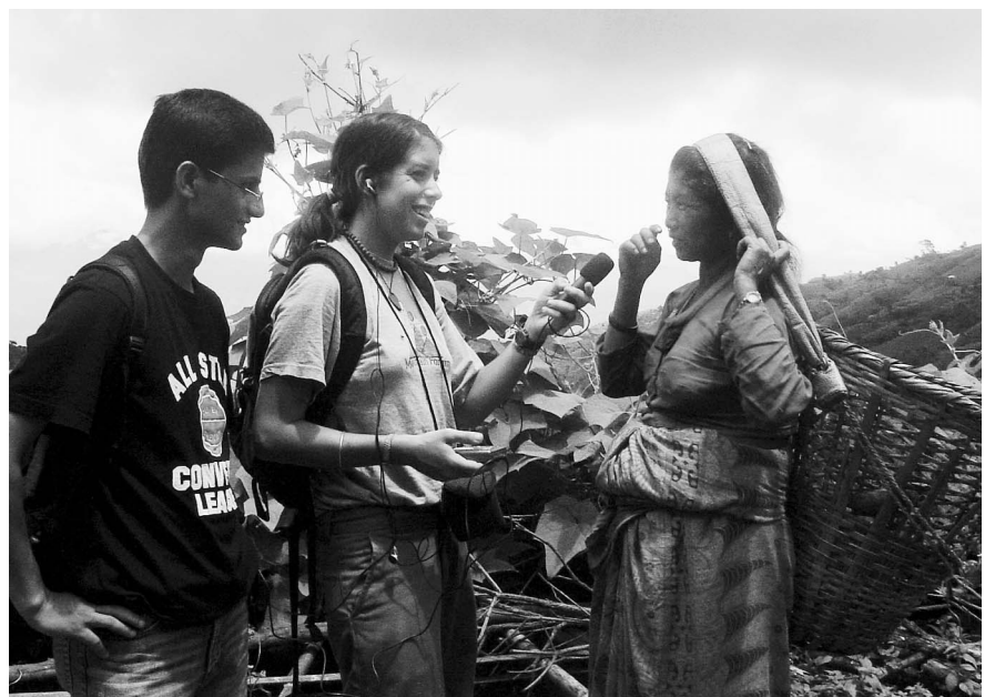
FIGURE 1 Interviewing a Tamang woman. Bhojeni, Kathmandu District, Nepal.

In the first phase, 8 such programs will be produced. As this is a pilot phase, the purpose is to assess whether such an approach—which