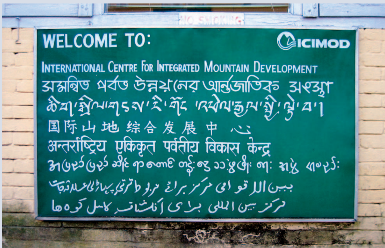
FIGURE 4 “Welcome to ICIMOD” in 8 different languages. The sign at the entrance to the main offices gives an indication of the multilingualism and linguistic diversity of the 140 staff.

Language revitalization campaigns aim to increase the prestige, wealth and