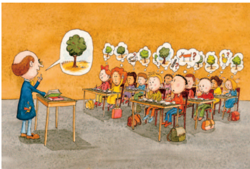
FIGURE 2 Educating Babel: the mother tongue dilemma. While studies show that students learn better through their mother tongue, the language has to be taught in school for the benefits to be reaped, which is rarely the case with minority languages.

This is particularly important because about 476 million of the world's illiterate people speak minority languages and live in countries where children are for the most part not taught in their mother tongue (Figure 2).