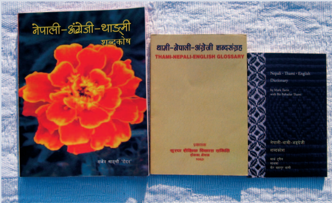
FIGURE 3 Cause for hope: after years of being forgotten by scholars and language activists, the endangered Thangmi language now boasts 3 dictionaries, all of which were published in 2004.

nation state. Ethnic and linguistic differences are also quick to be invoked in times of conflict.