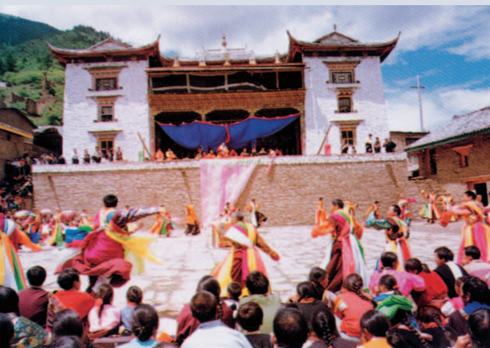
FIGURE 4 The ceremonious Lama temple fair in Jiabi Town, Li County is a grand gathering of all ethnic groups—a testimony to the ethno-cultural corridor function of the upper Min River Basin.

connected with Gansu and Qinghai provinces at the northern end and the Chengdu Plain at the southern end. This natural pathway along the river valley may have been a prerequisite for establishment of the cultural corridor in the basin. Ethnic diversity in the upper Min River Basin has also been closely related to migration and played a major role in cross-cultural transi-