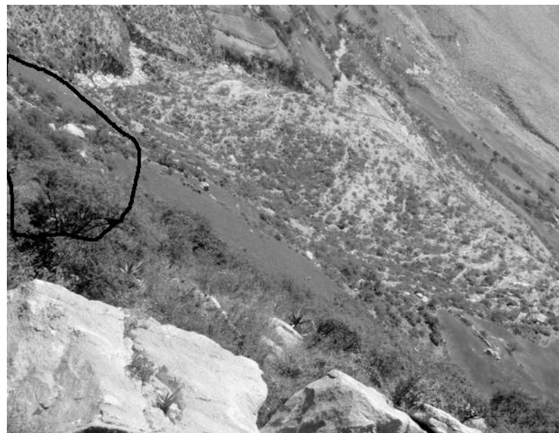
FIGURE 2 Protection of upper catchment through enclosure (black line) in the Tiya site.

Sedentary mixed farming is the mainstay of farmers in both localities. A strong tradition of social integration is evident in both areas. Crop production is mainly rainfed. Agriculture has expanded towards steeper slopes, which are cultivated for their marginal outputs. This has accelerated soil erosion and vegetation degradation in the areas. Degraded lands remain with little vegetation cover. But areas recently abandoned for restoration by enclosure are now regenerating, demonstrating change with worthwhile benefits, such as environmental beauty and economic incentives for local communities (Figure 2).