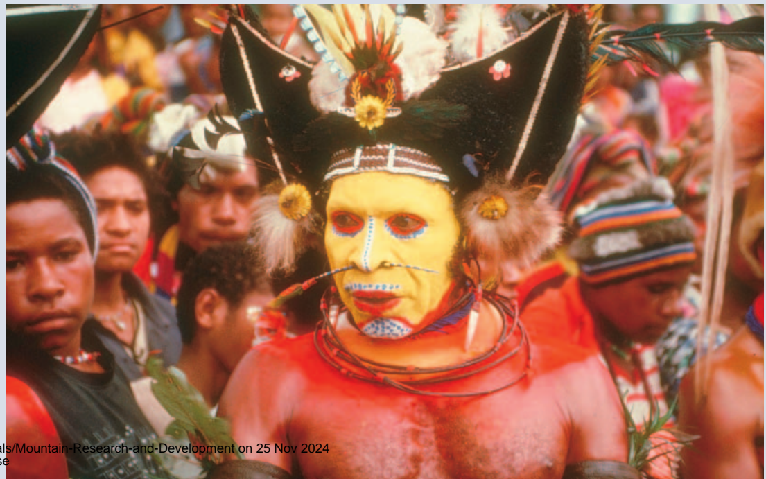
FIGURE 5 Huli tribesman. New Guinean tribes are a well-known example of extreme cultural diversity in a biologically very diverse environment.

versity inventories to socioeconomic analyses in order to formulate and begin to answer refined hypotheses regarding biocultural diversity. We will explore the role