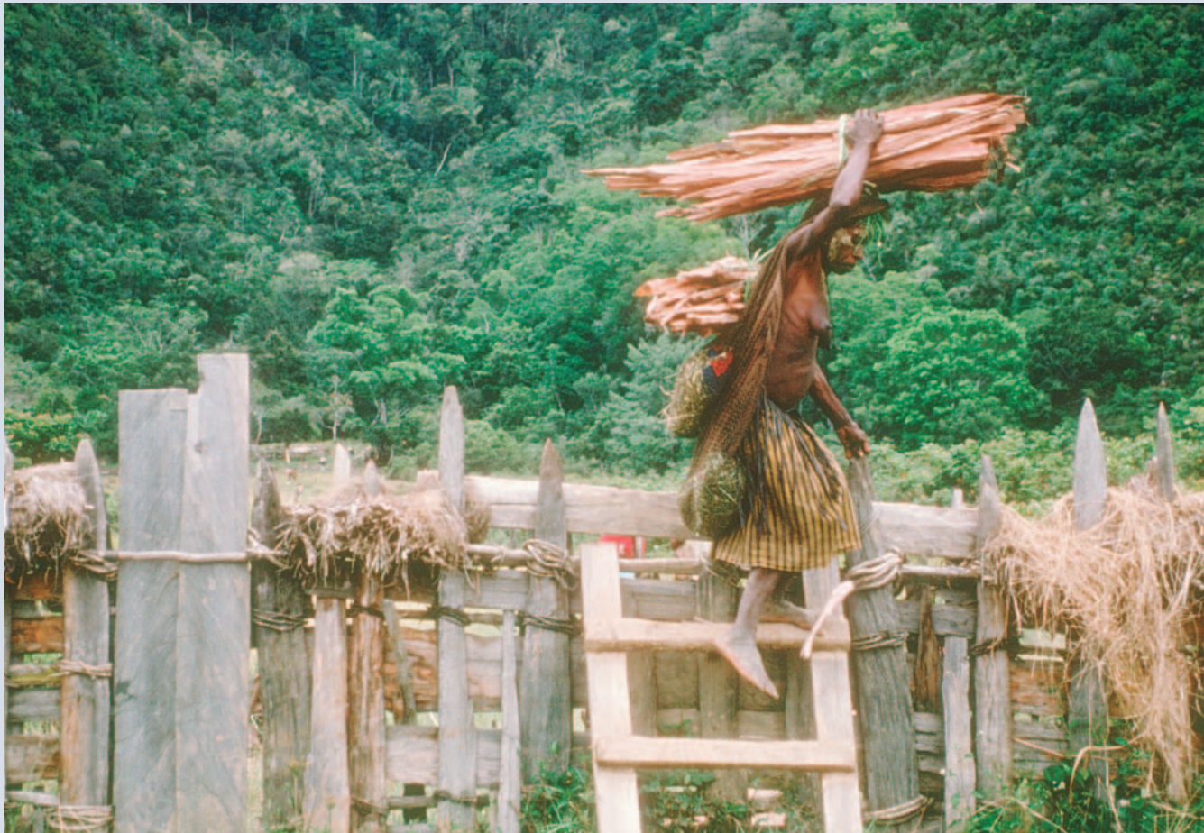
FIGURE 6 Firewood vendor in New Guinea; sustainable use of resources is a characteristic of mountain communities in this area of the world.

world, along with assessing their potential for appropriate and sustainable development.