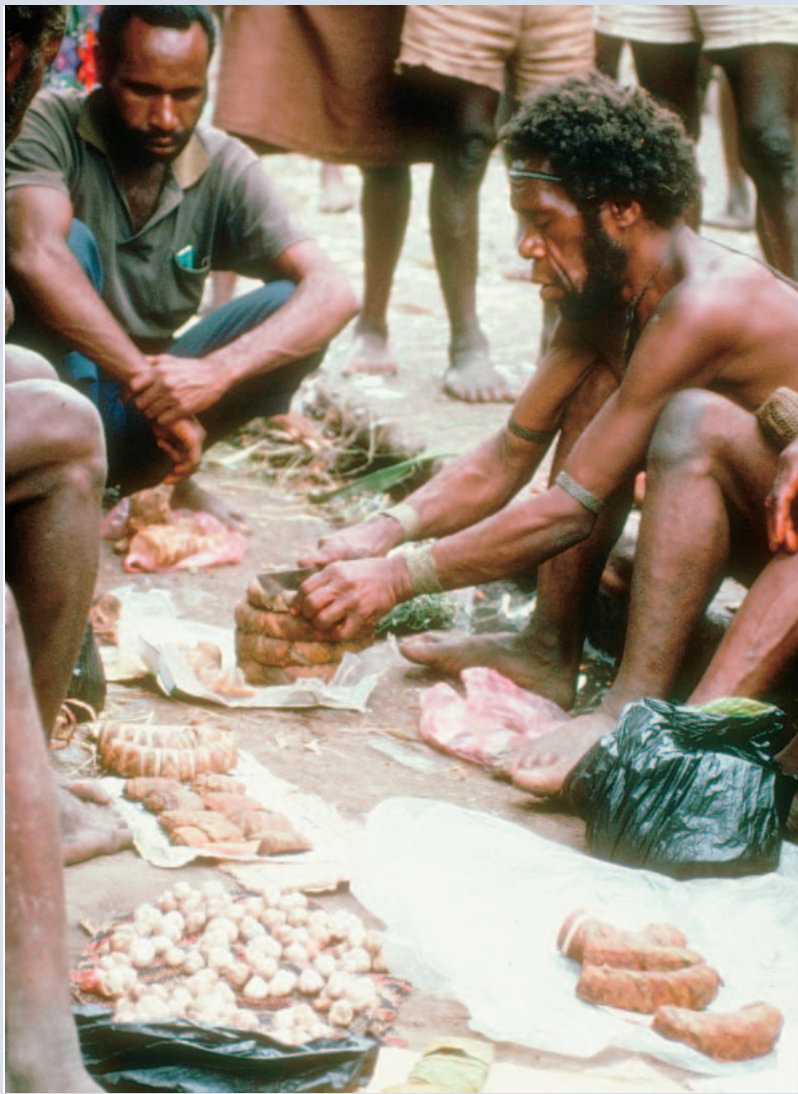
FIGURE 4 Tobacco merchant in New Guinea. Interestingly, exchange of goods in mountainous areas of the island of New Guinea has not led to loss of linguistic diversity.

of globalization, population growth, and land use/land cover change in biocultural diversity.