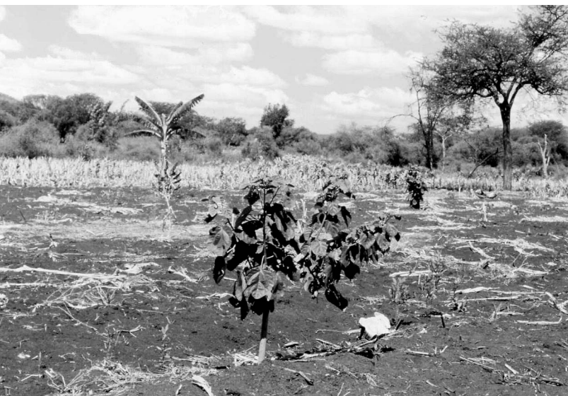
FIGURE 5 A Cordia africana sapling invading a farm in Rwarera. The banana tree in the background was transported from the upper slope area by a flood. (Photo by Sadao Takaoka, February 1999)

after the inundation; most were 1.0–1.5 m in height. Some were subsequently thinned out; 18 saplings remained by August 2000 and 14 were still there in August 2004. By then the highest was 7.0 m in height, 17 cm in diameter at breast height, and 27 cm in diameter at ground level.