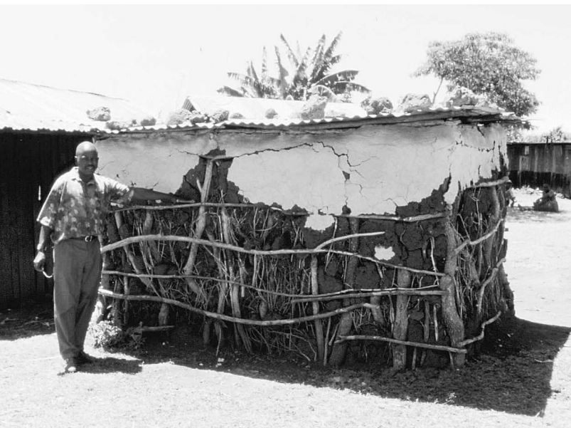
FIGURE 4 A house in Ruri. Note the lower half of the whitewash, which peeled off the wall following the January 1998 floods. (Photo by Sadao Takaoka, February 1999)