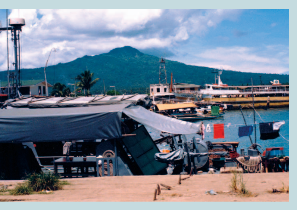
FIGURE 3 Bud Dahu and Bud Tumantangis have been sites of massive Philippine military operations disrupting all forms of social activities including education. In Indanan town, often only home-based traditional instruction is possible.

mountains of Mindanao often miss out on formal education for various reasons. Among these are: intermittent conflict (Figure 3); disinterest among a large percentage of the IP and minority population, who do not see the formal school curriculum as relevant; the distance of government schools from the ethnic communities; and grinding poverty.