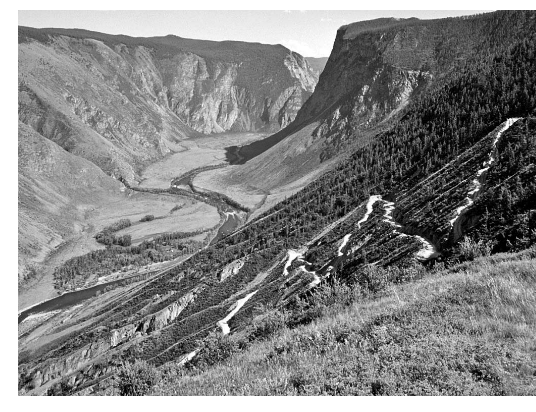
FIGURE 1 Chulyshman River Valley, showing a new road facilitating increased tourist access.

Dealing with the natural and social effects of the rapid growth of tourism, as well as the impending privatization of land, are the primary concerns of the Republic and local-level planning authorities. One of the strategies under development is the establishment of