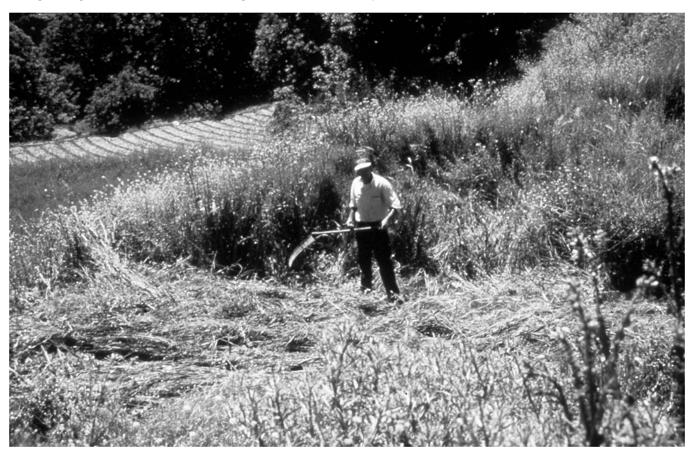
FIGURE 1 Because of the rough orography in the Sierra Nevada and the average age of the population working in the agricultural sector, innovation in the region is quite difficult.

heterogeneity that characterizes the different regions of the Sierra Nevada. This heterogeneity is manifested in the variety of natural resources and in the imbalance in funding for public infrastructure, as well as in the pronounced and faltering relief that characterizes this territory. It is also linked with the uneven population structure and the social, political, and economic stratification that this represents.