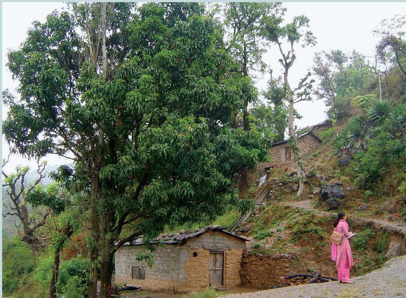
FIGURE 1 View of a traditional in-house watermill structure with water channel.

lence and the traditional wisdom of the people inhabiting the mountain region. In India, experts estimate that the watermill originated somewhere in the north-eastern region around the 7th century AD. The system worked harmoniously with nature for over 2700 years and is abundantly scattered across the