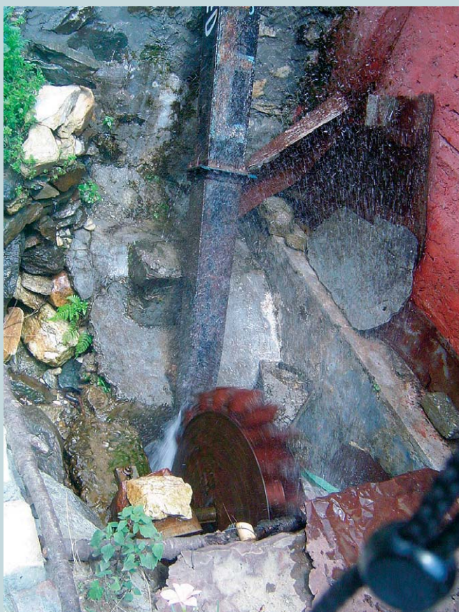
FIGURE 3 New steel runner and covered flume leading to much higher efficiency in using water power.