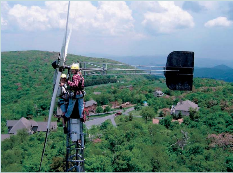
FIGURE 4 Students replace blades at Beech Mountain research site.

“Human agency very often leaves room for individuals or even entire communities to maneuver within or around the world economic system.” (Donald Davis, in Where There Are Mountains)