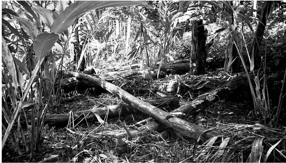
FIGURE 2 Cardamom cultivation in natural forest after selective thinning of tree canopy. East Usambaras, Tanzania.

difficult (Stocking and Perkin 1992; Hamunen 1998) (Figure 3).