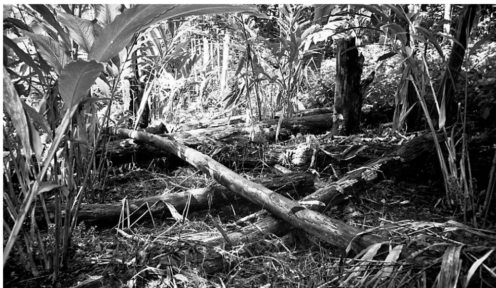
FIGURE 2 Cardamom cultivation in natural forest after selective thinning of tree canopy. East Usambaras, Tanzania.

difficult (Stocking and Perkin 1992; Hamunen 1998) (Figure 3).