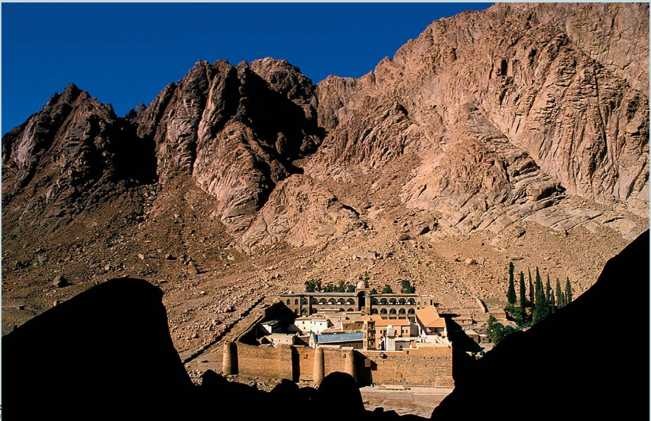
FIGURE 1 Monastery of St Catherine at the foot of Jebel Musa (Mount Sinai), Egypt.

The sacredness of mountains is manifested in 3 general ways. Firstly, certain peaks are singled out by particular cultures and traditions as places of sanctity. These mountains—the ones traditionally known as “sacred mountains”—have well-established networks of myths, beliefs, and