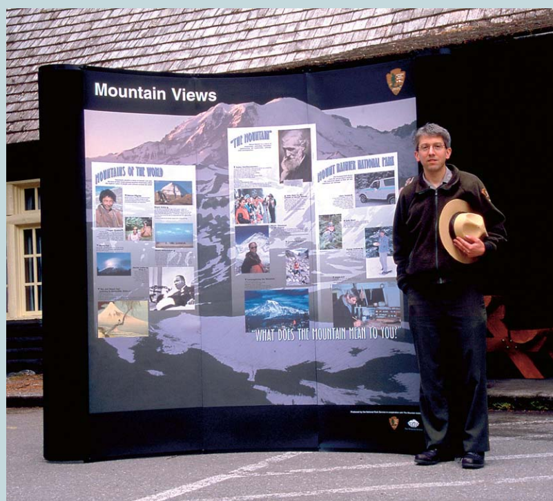
FIGURE 3 Mount Rainier traveling exhibit.

The exhibit has 3 sections: "The Mountain," "Mount Rainier National Park," and "Mountains of the World." Each section employs images of people with