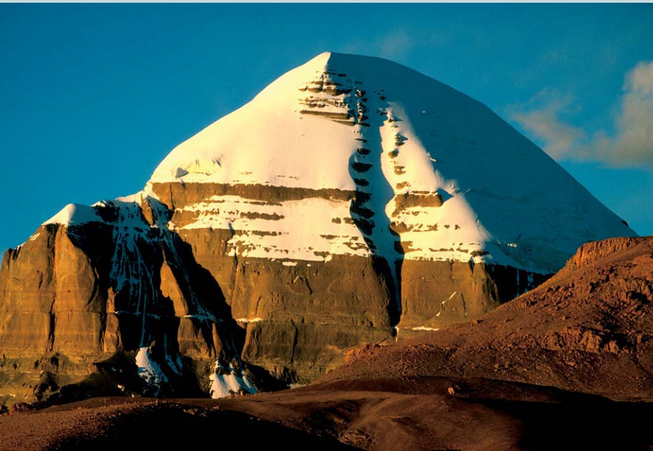
FIGURE 2 Mount Kailas, Tibet.

Deity or Abode of Deity. The power of many sacred mountains derives from the presence of deities—in, on, or as the mountain itself. Indians regard the graceful peak of Nanda Devi, a World Heritage site, as the abode of Nanda Devi, the Goddess of Bliss. A temple at the hill station of Almora has a well-known image of the deity. Native Hawaiians revere Kilauea itself as the body of the volcano goddess Pele.