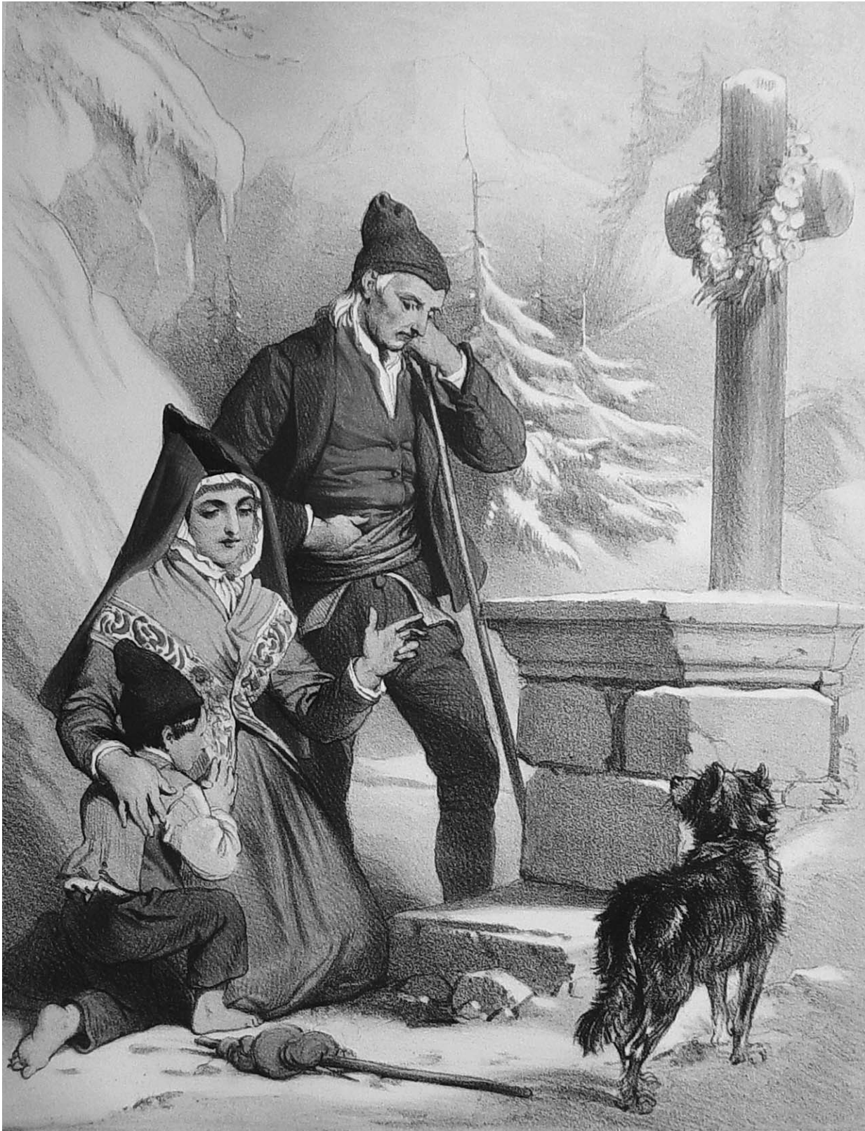
FIGURE 3 "A family in Barèges" (Vallée de Barèges, Central Pyrenees, France). Mid-19th century representation of a very conventional scene with unconventional costumes: Pyrenean society is imagined as Arcadia. This saint-sulpicienne picture (like the pious imagery and statuary selling in the shops around the church of Saint-Sulpice in Paris) represents a pretty young woman who drops her spindle to teach her child—barefoot in the snow—how to pray. A shepherd, with his crook and sheepdog, is more meditative than pious. Thus it is the mother who transmits belief in God. Why was the cross erected—to commemorate a dramatic event or remind passers-by of God? (Lithograph by Alfred Dartiguenave)