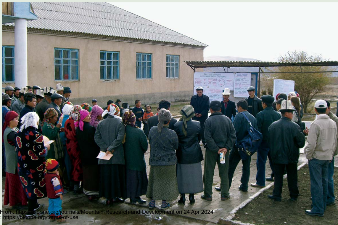
FIGURE 2 The main instrument and potential of TPSs (normally represented by a limited number of active people) is their ability to mobilize the majority of the village population when the need to discuss and solve different problems arises. Jergetal village, Kyrgyzstan.