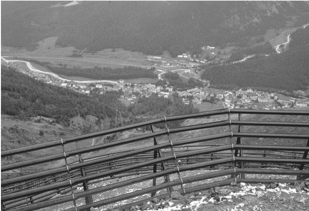
FIGURE 1 Avalanche fences above Pontresina in the Engadin (Grisons), Switzerland. These iron fences hold snow back, thus protecting against a dangerous mountain hazard.

cattle, sheep, and goat pasturing. It provided the basis for projects partly within the zone where subsidized engineering structures had been set up to provide protection from natural hazards and required replanting of damaged forest areas within 3 years of a natural calamity. Under the undisputed assumptions of a forest's capacity to protect inhabited areas downstream, the law made it possible to subsidize the building of access roads for forest owners as well as the construction of protective structures against avalanches, rockfalls, and soil movement in steep upland catchments. The law required maintenance of totally forested areas and was extremely restrictive with regard to clear-cutting and consequential changes in land use. Consequently, clear-cutting for highways and railroads was undertaken as closely as possible to already cleared areas.