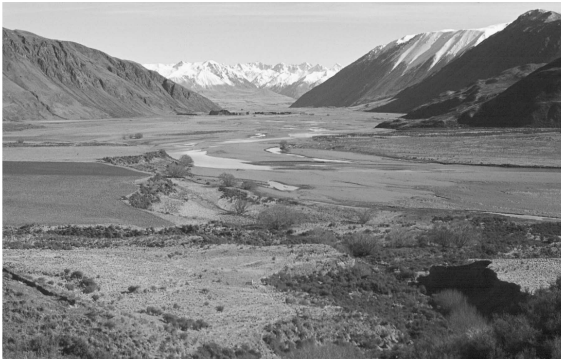
FIGURE 3 Upper reaches of the Rangitata River, South Island, New Zealand, looking westward from Erewhon to the Main Divide and showing mountain forests on steep south-facing slopes, dense shrub communities on steep north-facing slopes, cultivated pastures of introduced species for winter feed on high river terraces, tussock grassland and low shrubby vegetation on fluvio-glacial deposits along the valley floor, scree aprons extending from the mountain slopes to the current river course, and bare flood plain gravels flanking the river.

From the air, an area of native forest may look relatively healthy, but on the ground, it can be another story; the forest floor may have been stripped bare of woody plant seedlings and ground layer plants and the topsoil eroded. There are now more opossums than sheep in New Zealand, and most live in wooded areas.