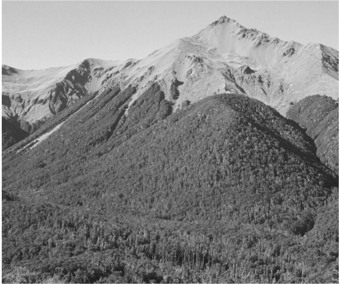
FIGURE 2 Mountain forest on middle and lower slopes with subalpine communities above treeline and avalanche runs extending through the forest, Lewis Pass, South Island, New Zealand.