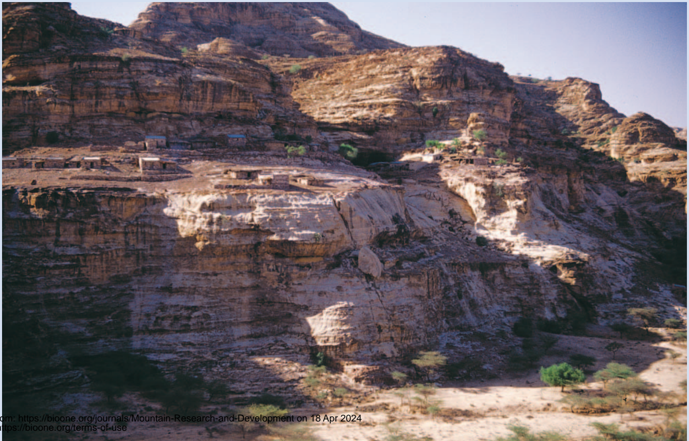
FIGURE 1 Adequate representation of sloping lands is a technical challenge in mountain GIS. Pronounced topography and great diversity of features within short distances—as are visible in this view of Adi Shanet, a mountain village in Eritrea—are heavily underrepresented on maps.

Because GIS is a “postindustrialized technology” developed for the needs of societies in Europe and North America, a