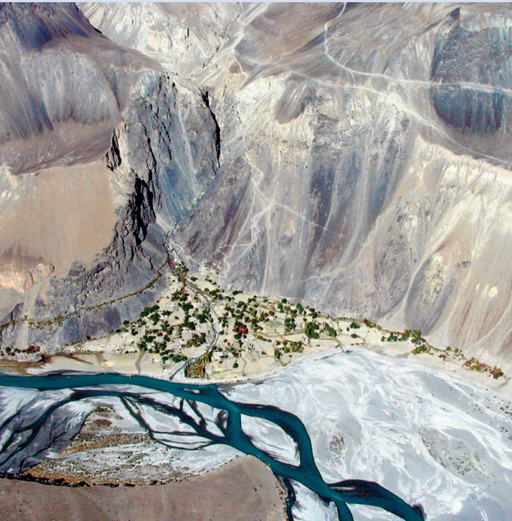
FIGURE 2 A typical village in the Pamir Mountains of Tajikistan. Small-scale patterns of land use systems in mountain areas require high-resolution input data for GIS. (Photo by Jean Schneider, published in: Breu T, Hurni H. 2003. The Tajik Pamirs. Challenges of Sustainable Development in an Isolated Mountain Region . Berne, Switzerland: Centre for Development and Environment, University of Berne.)