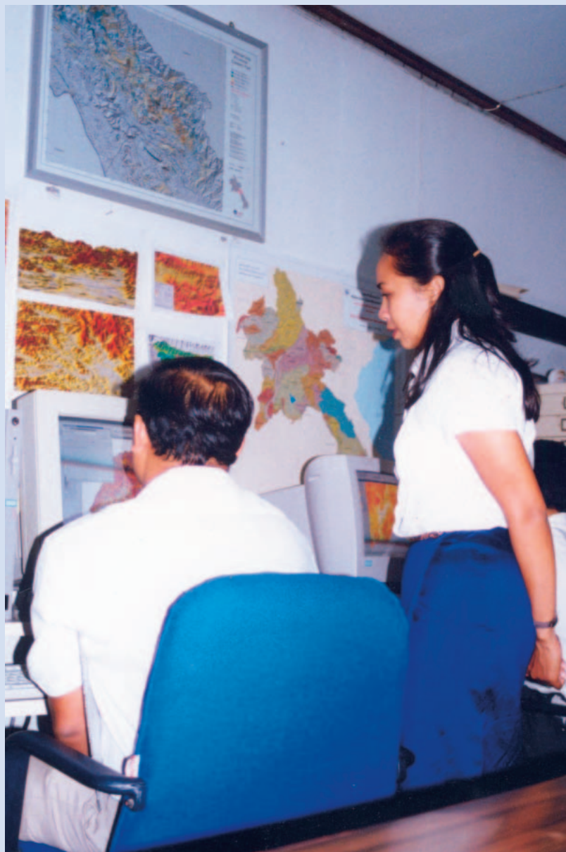
FIGURE 5 The key to successful GIS activities in development is continued technical and topical backstopping, preferably through South–South cooperation.

pronounced topography and their great diversity within short distances. Comprehensive GIS capacity building should include the following fields: