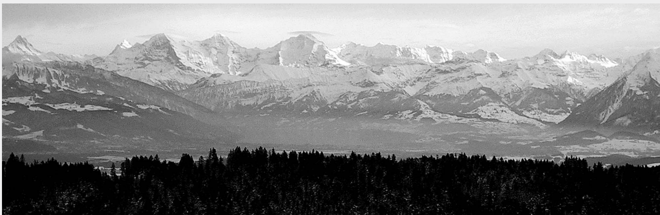
FIGURE 1 November snow on the Jungfrau–Aletsch–Bietschhorn World Heritage Site in Switzerland; view from the northwest.

UNESCO, Division of Ecological Sciences, Man and the Biosphere (MAB) Programme, 7 place de Fontenoy, 75532 Paris 07 SR France. t.schaaf@unesco.org