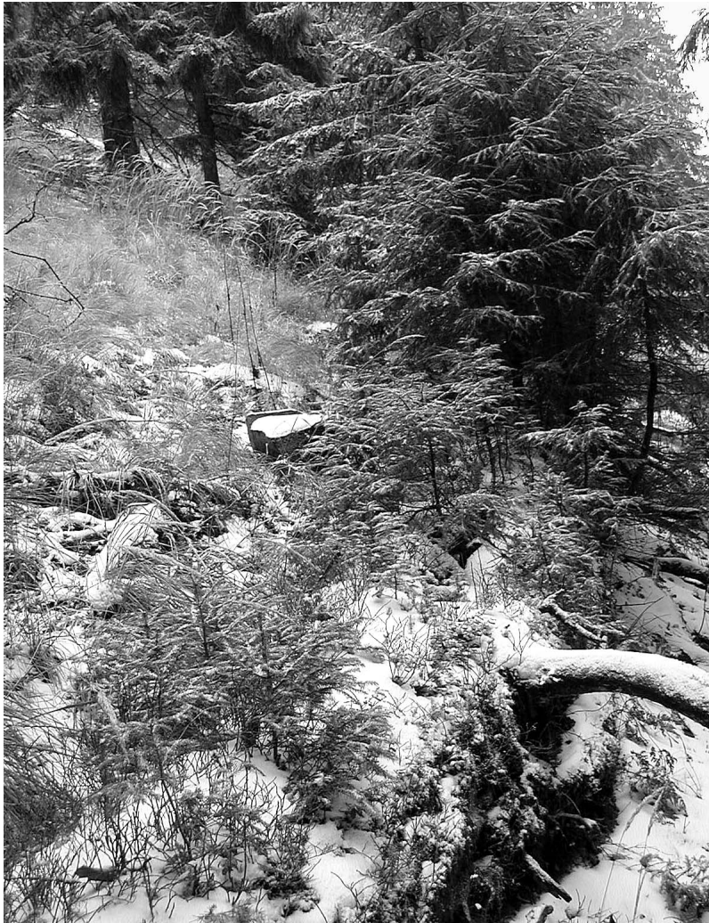
FIGURE 2 Natural regeneration in high-mountain spruce stands often occurs only on partly decomposed wood containing sufficient water and nutrients and is therefore a slow process.