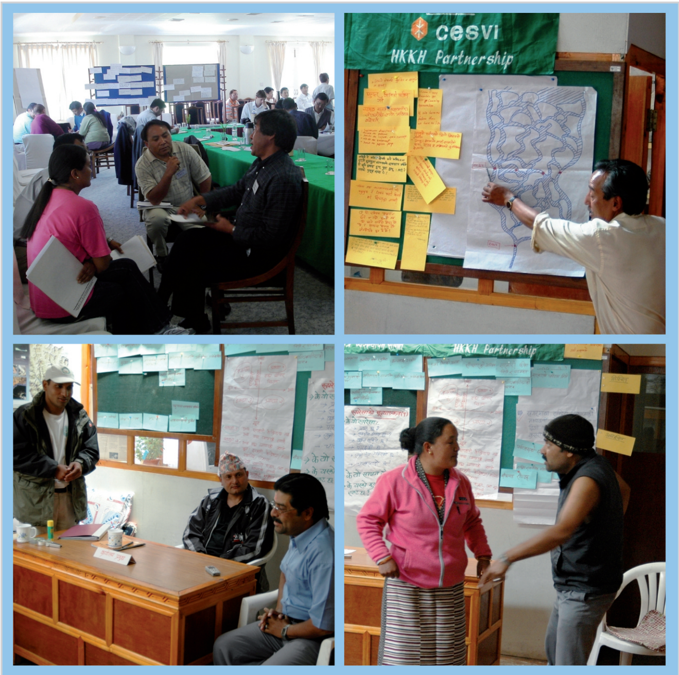
FIGURE 3 Clockwise from top left: (1) Scenario group work with tourism industry and NGO experts during the first workshop; (2) we presented the growing uncertainty of future park states and trajectories as sequential points along a braided river channel; (3) during our second scenario workshop, an actor plays a rogue community member as a metaphor for loss of local social norms; (4) in another dramatized scenario, an outside businessman tries to influence local park officials.

strongly supported park management devolution and local self-governance. However, discussion of the “autonomous Khumbu” scenario surprisingly revealed that participants did not have full confidence in local