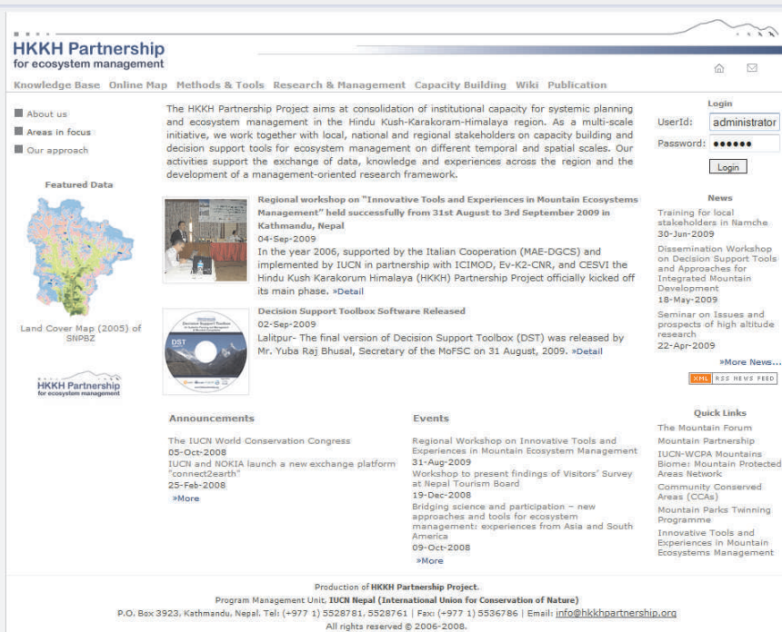
FIGURE 1 Main page and user interface of the IWP.

The IWP has been designed and built with a customized content management system (CMS) focusing on the project contents by establishing simple and easy management of information resources through a workflow process and a common framework for information authoring, approving, publishing, and archiving. This framework provides techniques that assist in the development of ideal information environments (Batley 2007). In addition, the IWP system was designed keeping in mind that novice users with little or no technical background can use, operate, manage, and maintain the web portal involving a diverse user community and remote locations. Figure 2 outlines the architecture of the IWP, and the subsequent section describes its major modules.