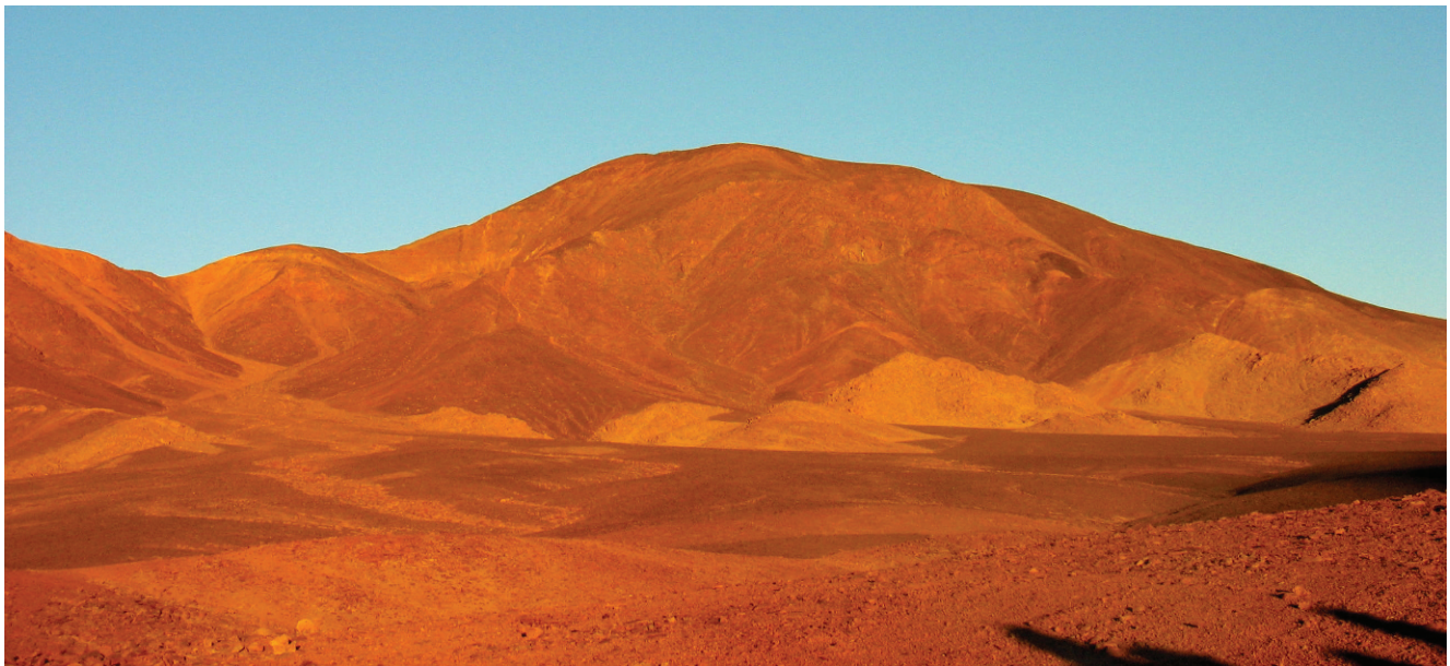
FIGURE 2 Mount Quimal, 4278 m high, seen from the base of the mountain. An old road can be used to go as far up as 3800 m in a 4-wheel drive vehicle. The mountain top can then be reached in a 2- to 3-hour hike. Cerro Quimal is so high that the presence of the mast or any other object on the mountain peak cannot be seen on the photo.

knife. But, installing an antenna on a sacred mountain, such as Mount Quimal, is particularly injurious and dangerous, because an external and nonnatural element inevitably disturbs the mountain, and this generates all sorts of material and spiritual disorders.