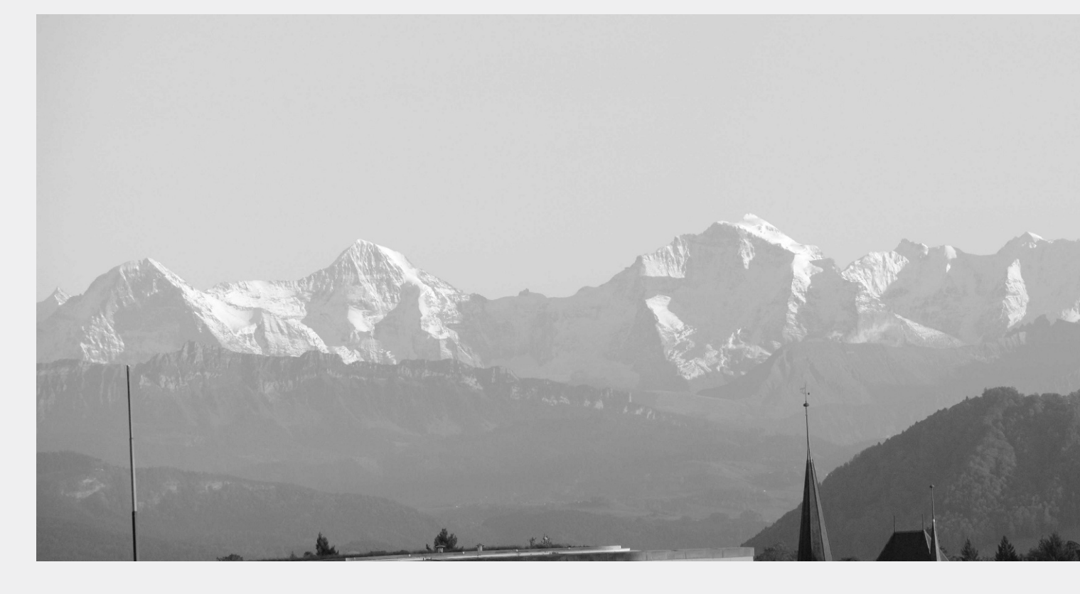
FIGURE 1 The Swiss Alps and Swiss mountain policy: panorama of the Alps from Bern, Switzerland's capital city, with a glimpse of the parliament building on the right (see next page).