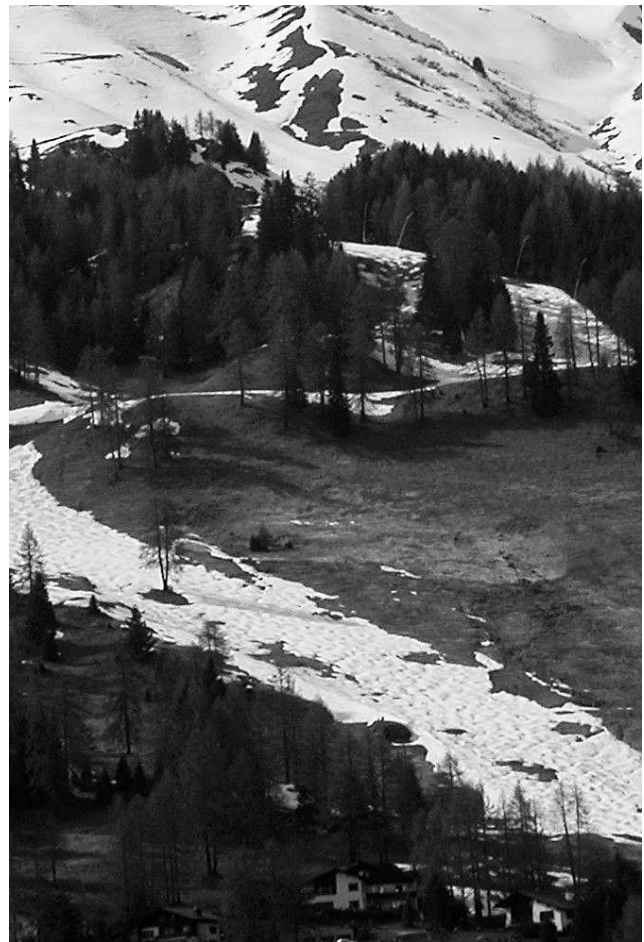
FIGURE 1 Ski piste with artificial snow in Davos where snow melts more than two weeks later than adjacent to the piste.

Our investigations were carried out in the 3 Swiss tourism destinations of Davos (9°50'E, 46°48'N; Figure 1), Scuol (10°18'E, 46°48'N), and Braunwald (8°59'E, 46°56'N). These regions represent different types of destinations and different climates in the Alps, and, therefore, may be representative for other tourist destinations. Davos is one of the largest communities of Switzerland (284 km 2 , ~12,500 inhabitants) and the highest town of Europe. The mean annual temperature is 2.8°C, and the mean annual precipitation is 1175 mm. Five ski resorts range between 1560 and 2844 masl, the largest being Parsenn-Gotschna and Jakobshorn. Davos also is renowned for its congress infrastructure. The municipality of Scuol covers 144 km 2 (2400 inhabitants), and its ski resort Motta Naluns ranges from 1250 to 2785 masl. Scuol is popular among tourists because of its relatively dry climate (750 mm annual precipitation, 6°C mean annual temperature) and a spa. Braunwald is a small municipality of 10 km 2 (~350 inhabitants). Its ski resort ranges from 1250 to 1904 masl, and the precipitation amounts to 2000 mm (mean annual temperature 5°C). The destination is popular among tourists because of its vicinity to the town of Zurich and because it is car-free and family friendly.