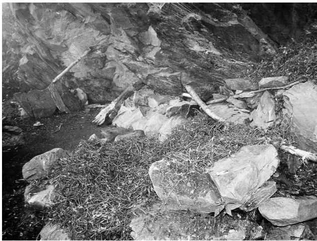
FIGURE 2 Collectors' camp under rocks: note the living space and sun drying of kutki on rocks.

Of the 85 collectors interviewed, 95.29% ( n = 81 ) were dedicated and 4.71% ( n = 4 ) were opportunistic. Dedicated collectors are those who camp and collect medicinal plants for a longer duration (up to 3 weeks) in very remote areas and focus on collection of a single species, while opportunistic collectors combine this with other activities such as livestock grazing and fuelwood collection (Olsen 1998) and may include collection of multiple species. Women were generally opportunistic collectors in the study area. The collectors reported many serious injuries, including the death of 1 person in 2009 during Picrorhiza collection on steep slopes.