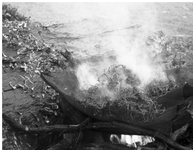
FIGURE 4 Drying of kutki in hearths, using local fuelwood.

weight of fresh material is reduced by half. Around 70–80 kg of fuelwood is burned in the process. The major species used for fuelwood are Juniperus indica , Rhododendron campanulatum , and Betula utilis . The distance traveled to collect fuelwood varies from 1.5 to 2.5 km. This requires 4–8 hours per week. Thus, in addition to collection, processing of raw material is also a backbreaking task.