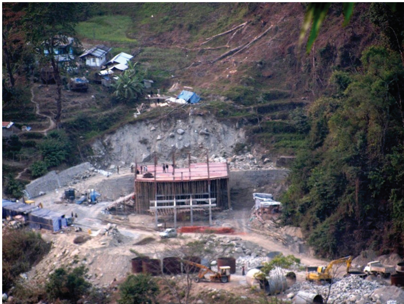
FIGURE 2 Site of a hydroelectricity project construction on former agricultural land in Sikkim. Remnants of agricultural terraces are visible around construction.

Many villagers said that the village forests they traditionally used for firewood and fodder collection were destroyed by construction work. Agricultural and forest land impacts were mostly temporary and could be reversed by applying suitable mitigation measures, as indicated in Table 1.