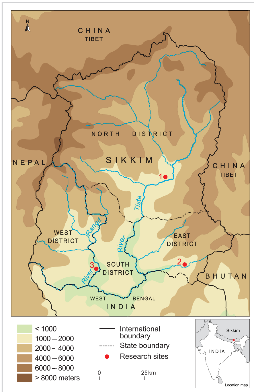
FIGURE 1 Map of Sikkim showing drainage and research sites. (1) Shipgyer; (2) Chujachen; (3) MSK. (Map by Chandra Jayasuriya)

Subba 2008). The state has rugged terrain and unstable rocks dissected by actively eroding streams and rivers. The whole state is well drained by numerous tributaries of the River Teesta, the main one being the Rangit (Figure 1).