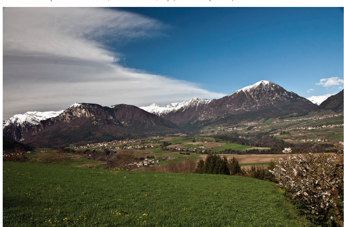
FIGURE 1 The valley of Giudicarie Esteriori, Province of Trento, Italy.

flourishing tourist industry on the lake, the provincial administration decided that something had to be done about the environmental pollution due to the local intensive dairy farming.