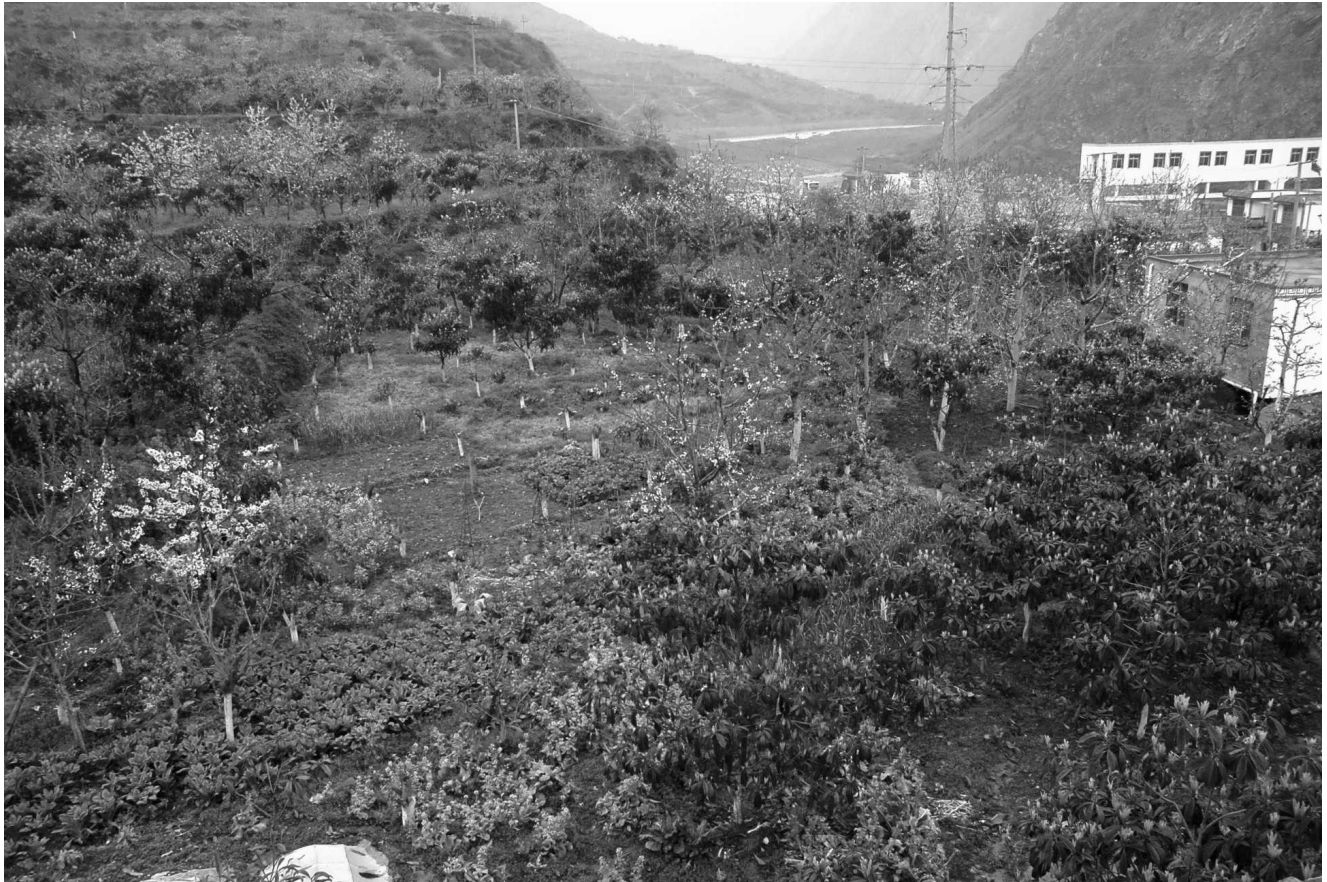
FIGURE 4 Mixed fruit farming in study area. An orchard with apples, cherries, plums, loquats, and vegetables in Feng Mao village.

hiring them varies from US$ 12–19/person/d, which has led to a substantial increase in the cost of producing apples. This, coupled with the falling market prices for Maoxian apples, has been the key factor that compelled farmers to look for other crops.