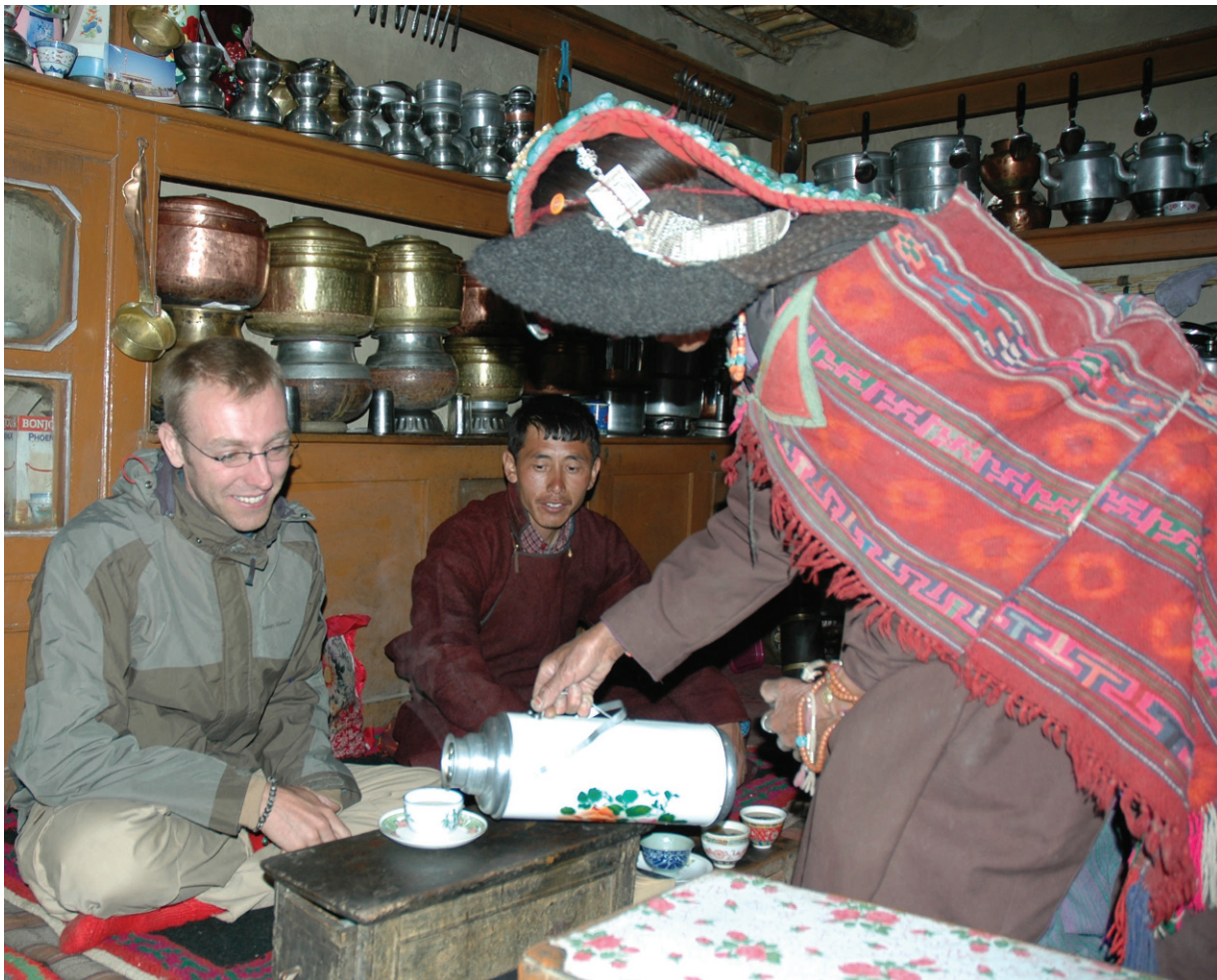
FIGURE 5 Guests enjoying traditional butter tea at a homestay.

spend on. Although some have invested in their children's education, others have purchased consumer goods. The Changpa households that live in tents in and around the Korzok settlement are also not benefitting economically from the homestay initiative, unlike their counterparts who live in permanent dwellings. Even if the seminomadic Changpas decide to join the homestay venture, it will invariably increase pressure on the ecosystem as well as competition. The TCT will need to evaluate and assess the optimal number of tourists the area can support in the future. Efforts such as banning trekking and camping in the grazing land in the surrounding areas have been undertaken to minimize impacts, but the rapidly growing tourism industry will continue to exert pressure on this fragile ecosystem. This calls for an evolving strategy for addressing future concerns. There also is a need to integrate traditional and spiritual belief systems with sustainable practices that have had documented impact on restoring habitats. For instance, Changpas depend on Tibetan astrological predictions recommended by monks for herd movements to different pastures (Namgail et al