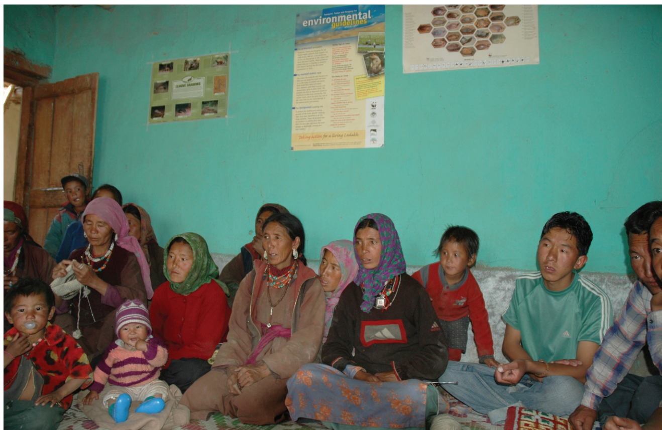
FIGURE 2 Local women receiving training in a homestay at Korzok.

to make these transitions. Understanding the gap in required skills, WWF-India facilitated a series of capacity-building exercises (Figure 2) for the Changpa community with homestay facilities. The resource persons were fellow Ladakhis who had experience with running successful homestays near the Hemis National Park. The capacity-building exercise included hands-on experience with a wide range of subjects such as hygiene, waste segregation, developing marketing strategies, handling finance, and drawing up and finalizing guidelines for tourists. Selected youths from the village were trained as wildlife guides, and financial assistance was provided to the women's self-help group to start a parachute café in the village. The training programs stressed the close and clear link between ecological conservation of the area and the livelihood sustenance of the villagers.