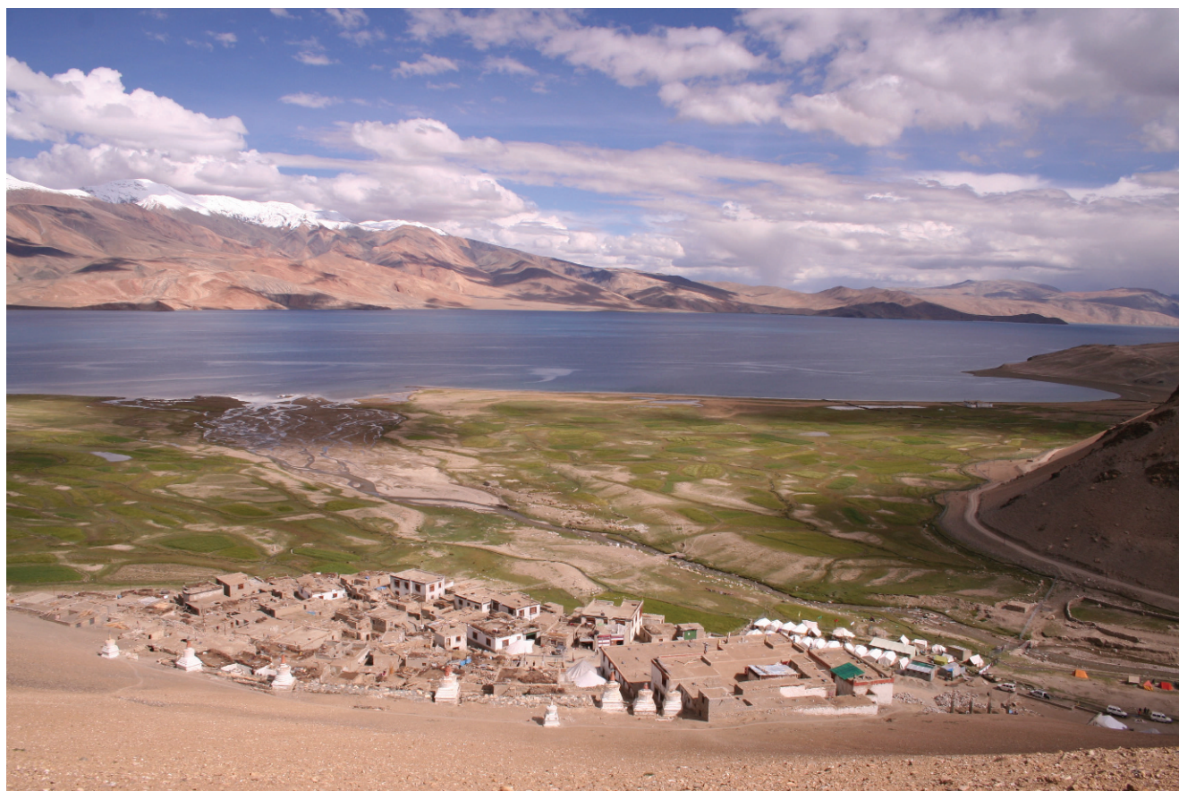
FIGURE 1 Korzok Village with Lake Tsomoriri and the designated tourist camps in the background.

The central development issue in Korzok was to create conditions for an enabling environment that would reconcile the needs of generating alternate livelihood opportunities and high-altitude wetland conservation to support the local economy and reduce poverty through a socially inclusive green tourism project. The main development issue, the evolution of the initiative, and some of the early impacts of the project constitute the focus of the present article. The case of Korzok is unique