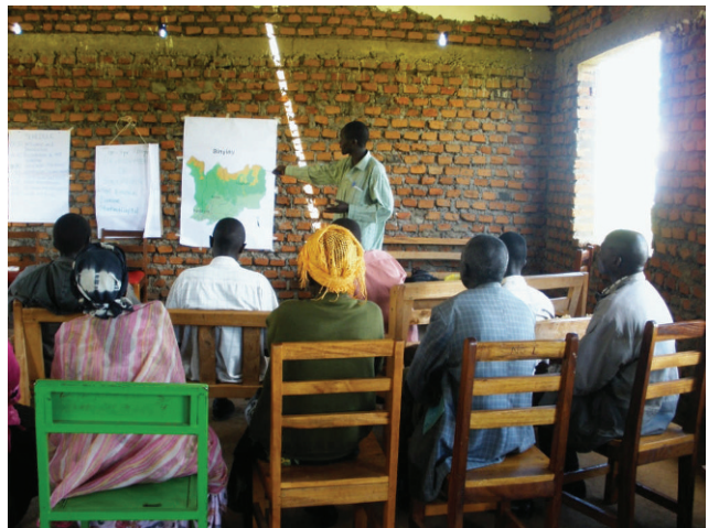
FIGURE 4 Participatory process in the Binyiny community workshop, Uganda.

An evaluation questionnaire consisting of open- and close-ended questions was carried out at the end of each workshop to find out whether the participants had found the workshops useful for deliberation, decision-making, learning about other stakeholders’ perceptions, and enabling individual expression. An additional survey questionnaire was sent to the district workshop participants after 5 months to evaluate the impacts of the workshop and to provide insights into medium-term outcomes of the deliberation processes.