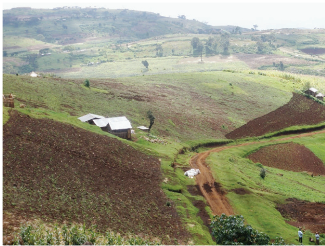
FIGURE 2 Typical hillslope field undergoing soil erosion, Mt. Elgon, Uganda.

watershed of international importance. It is an important catchment for some of the major rivers that feed the lakes in the Nile River system in Uganda and Lake Turkana in Kenya. A large rural population depends on the ecosystem goods and services of the forest (Muhweezi et al 2007). Smallholder subsistence farmers with a mixed crop and livestock production system are typical in the area: the average farm size is 0.8–1.6 ha (KDLG 2006). The watershed encompasses 5 subcounties adequately