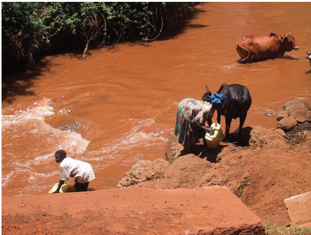
FIGURE 3 River Ngenge heavily silted with eroded soil, Uganda.