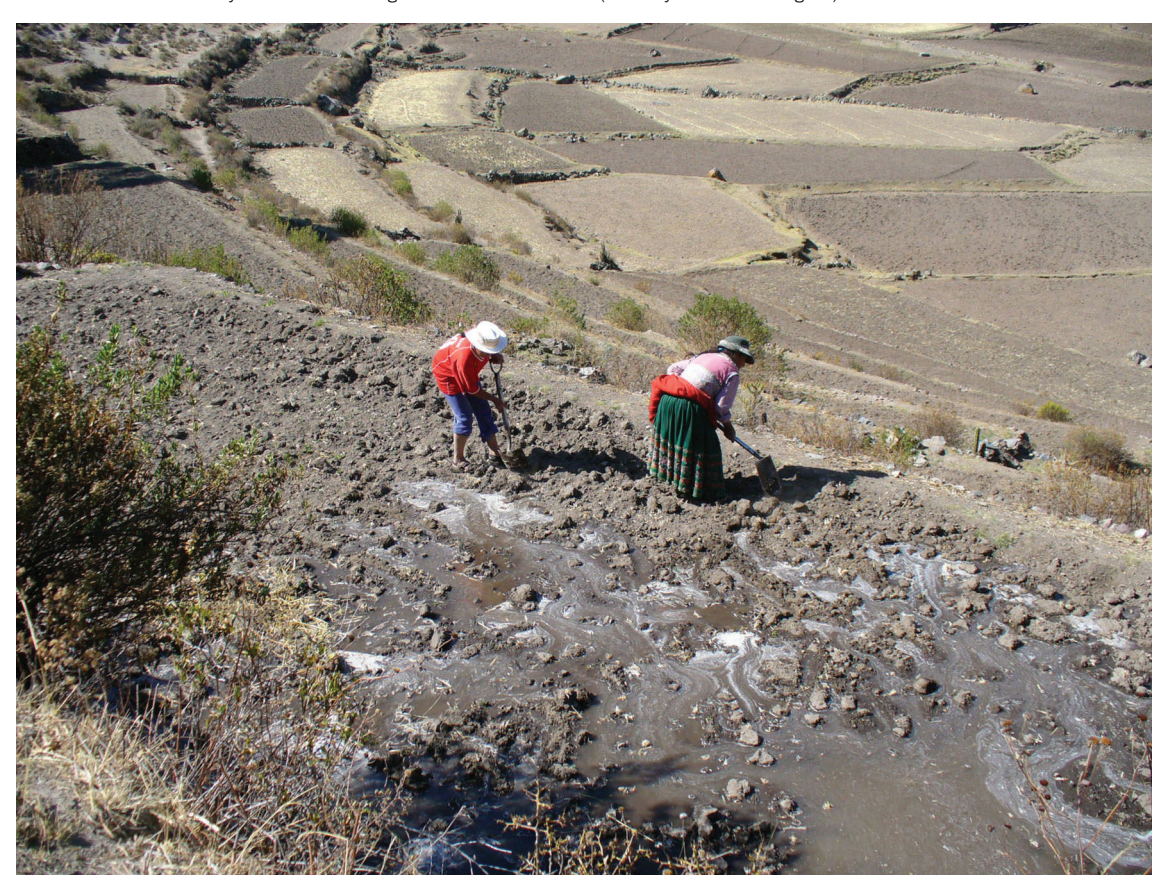
FIGURE 2 The Colca Valley is famed for its terraces and its aridity. This photo shows the steep terraced landscape and local irrigation practices under which land is carefully maintained and irrigated with available water.

PROFODUA (Programa de Formalización de Derechos de Uso de Agua [Program to Formalize Rights to Use Water]). PROFODUA granted and formalized the use of water rights individually and in blocks, thus avoiding use of the term "collective rights." Such rights could be traded or exchanged by their holders, which meant that conditions were in place for a market in water rights to emerge. Some Andean communities, including the Colca Valley, resisted the implementation of PROFODUA. They demanded the recognition of their communal right to water and rejected individual entitlements. Because of this contentious issue, PROFODUA only formalized the individual water rights of users in blocks of the coastal irrigation systems (Vera 2011).