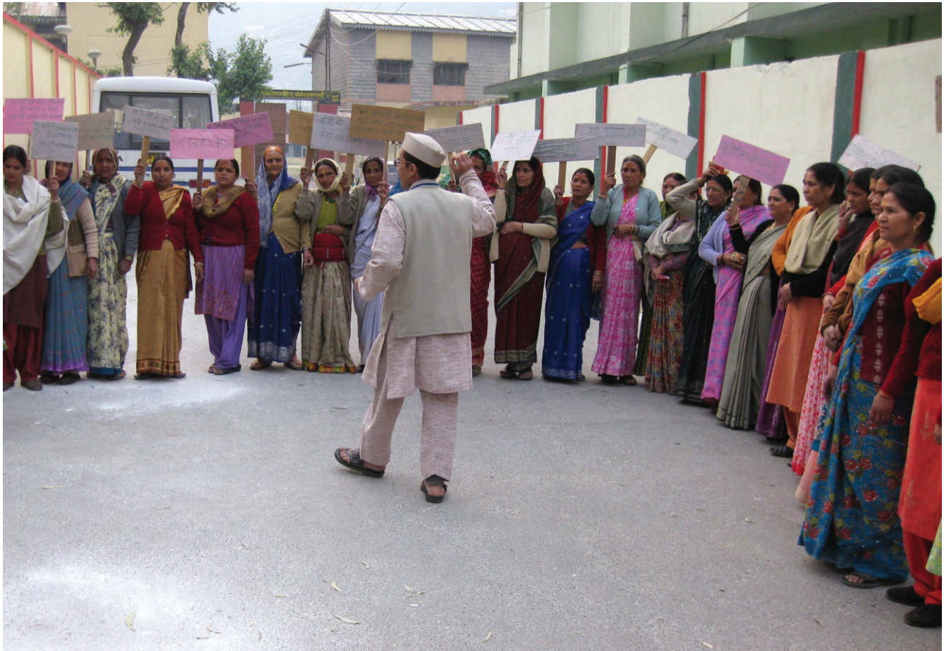
FIGURE 3 Man leading a rally during a “Save the Ganga” campaign.

worried that the Ecologically Sensitive Zone he campaigned for would also lead to the creation of a conservation zone that would leave little room for mountain residents to demand and realize regionally appropriate development measures such as microdams on small tributaries and other projects that could be designed with a lighter ecological footprint while promoting regional employment.