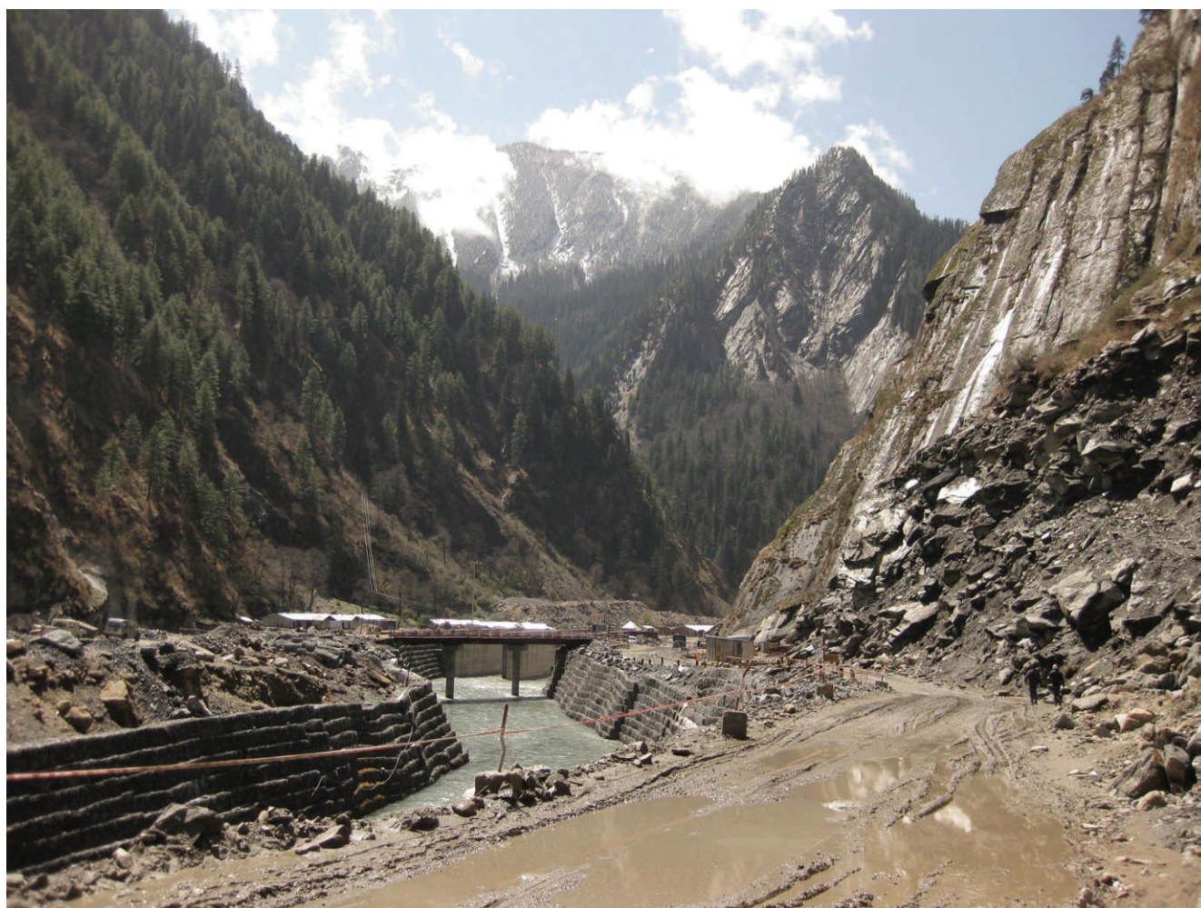
FIGURE 1 Road construction and water diversion for the Loharinag Pala Hydel project.

Sikkim (Chandy et al 2012). Some of the construction activities involved occasional roadblocks and other disturbances that hindered the flow of pilgrimages and tourism, a seasonal mainstay of the regional economy. Several fatal car accidents were also attributed to the hastily created infrastructure, including roads that crumbled under the weight of large vehicles. In 2009, a bus with schoolchildren, teachers, and villagers tumbled down a ravine near a dam construction site. Several other cars suffered similar fates, though it is difficult to tell whether the cause was the roads or the monsoon rains that chip away at the hillsides.