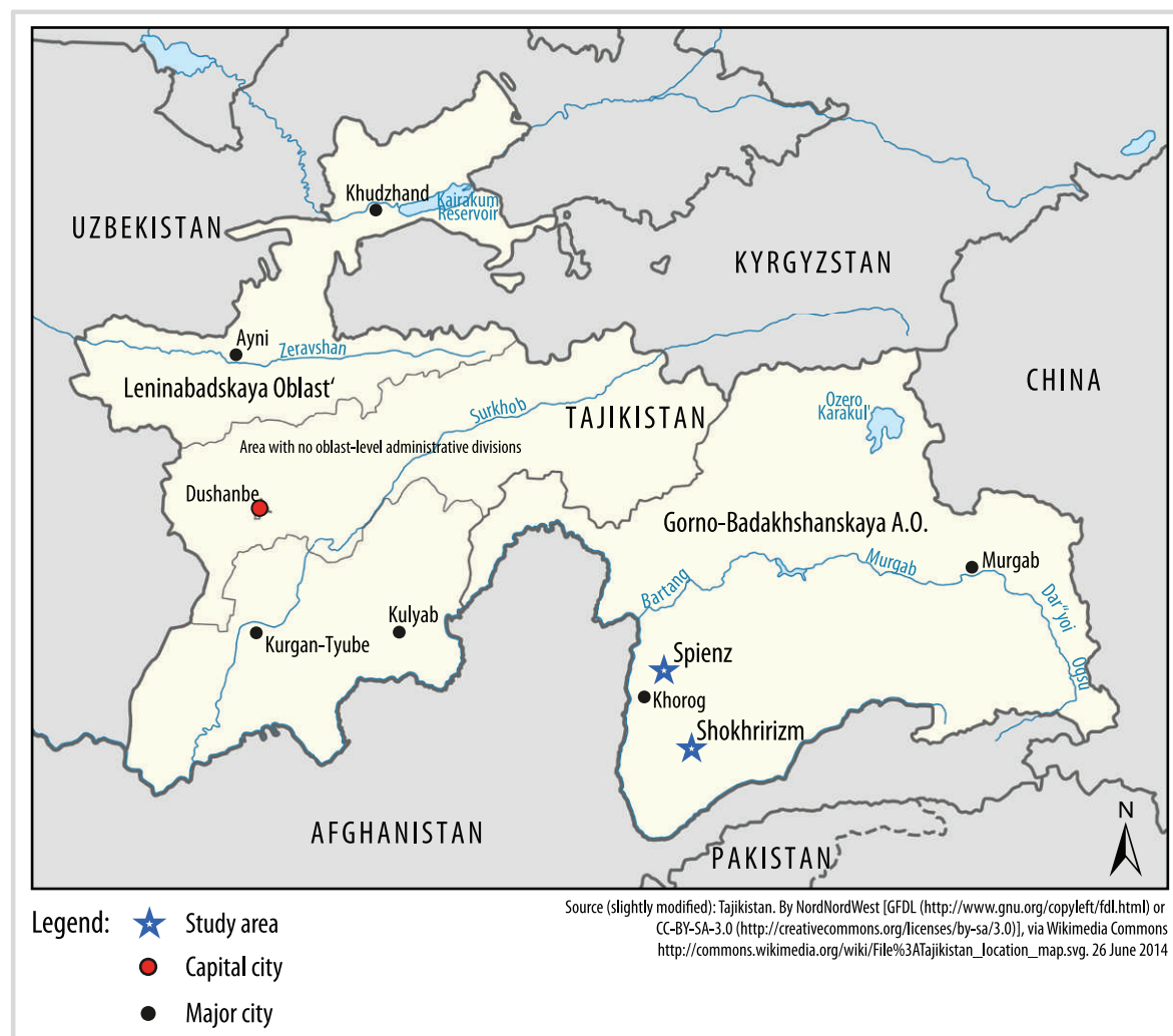
FIGURE 2 Location of the 2 case study sites in Tajikistan. (Map by Sarah-Kay Schotte)

considered the number of female-headed households and emigrants. Consequently, 2 villages were selected: Spienz (with 49 households and 276 inhabitants), situated in the Gunt valley at 2345 masl, with a latitude and longitude of 37°31'31"N and 71°37'17"E, approximately 20 kilometers from Khorogh, the capital of Gorno-Badakhshan, and Shokhririzm (with 56 households and 339 inhabitants), situated in the Shokhdara valley at 2983 masl, with a latitude and longitude of 37°11'49"N and 71°59'14"E, approximately 80 kilometers from Khorogh (Figure 2).