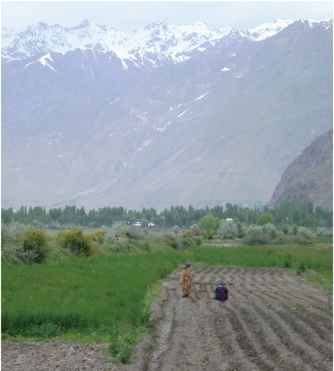
FIGURE 4 Women weeding a field.