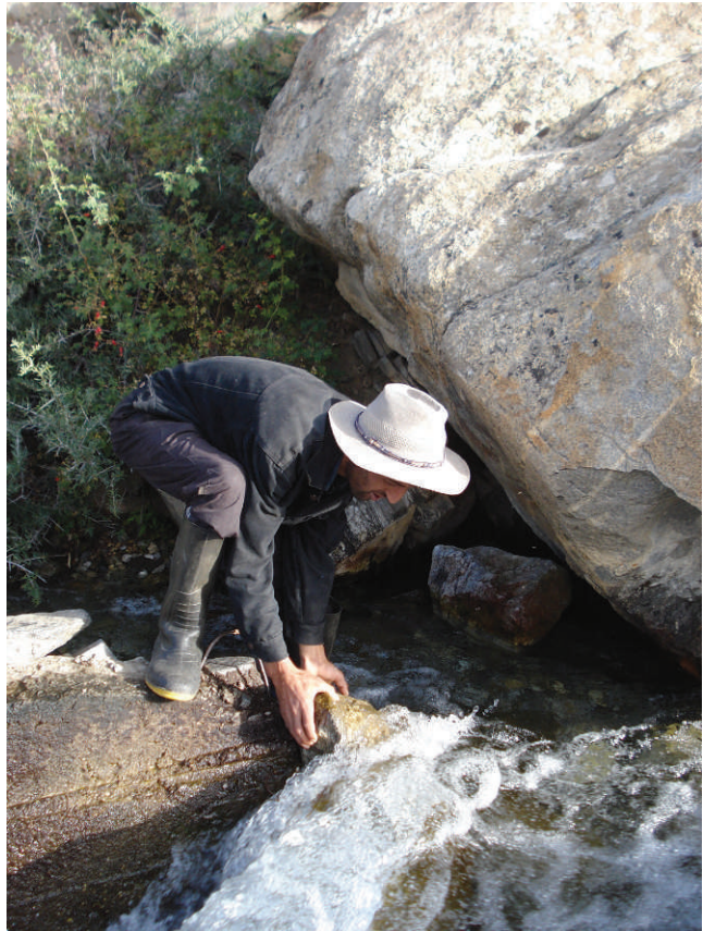
FIGURE 1 The mirju (water master) removes stones from the canal in Spienz.

Finally, the linkages between formal water institutions and gendered agency are mediated by locally and historically specific and dynamic configurations of claims, responsibilities, and rights. As earlier gender and irrigation studies also showed, these are articulated in households through what Jackson has called the conjugal contract (Jackson 2009). Our analysis shows that they also involve wider networks of interdependencies and mutual help. Hence, agential powers—for instance, for accessing or controlling water—reside in one's capacity to maintain interpersonal networks both within and beyond households. Our findings further suggest the importance of including men's and women's own perception of their powers or the value of their work in the analysis of gendered agency. This depends on their aspirations and sense of gendered selves, which in turn are colored both by prior cultural experiences and by imaginings of possible futures.