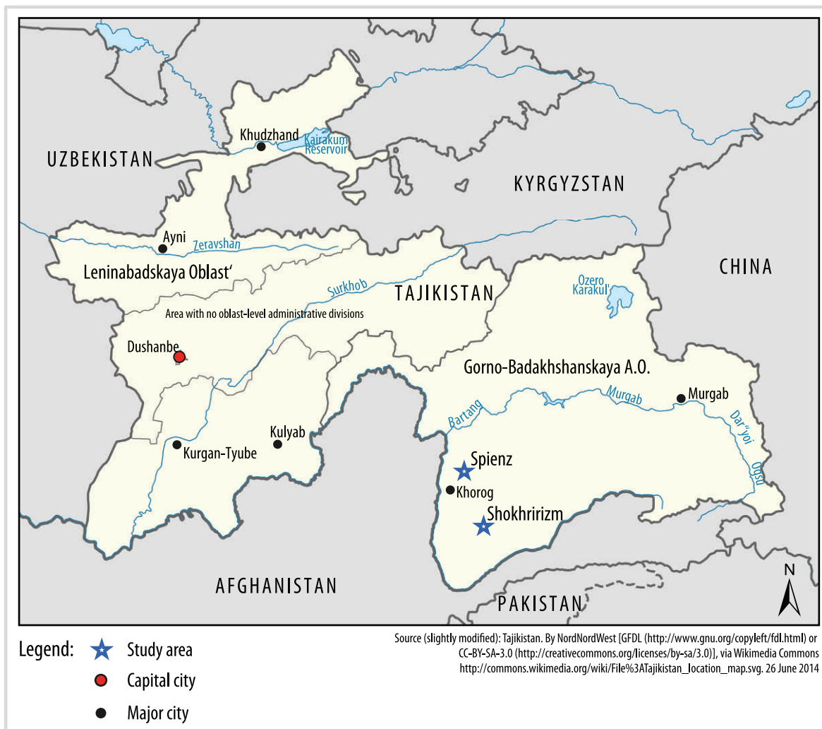
FIGURE 2 Location of the 2 case study sites in Tajikistan. (Map by Sarah-Kay Schotte)

considered the number of female-headed households and emigrants. Consequently, 2 villages were selected: Spienz (with 49 households and 276 inhabitants), situated in the Gunt valley at 2345 masl, with a latitude and longitude of 37^{\circ}31'31''\text{N} and 71^{\circ}37'17''\text{E} , approximately 20 kilometers from Khorogh, the capital of Gorno-Badakhshan, and Shokhririzm (with 56 households and 339 inhabitants), situated in the Shokhdara valley at 2983 masl, with a latitude and longitude of 37^{\circ}11'49''\text{N} and 71^{\circ}59'14''\text{E} , approximately 80 kilometers from Khorogh (Figure 2).