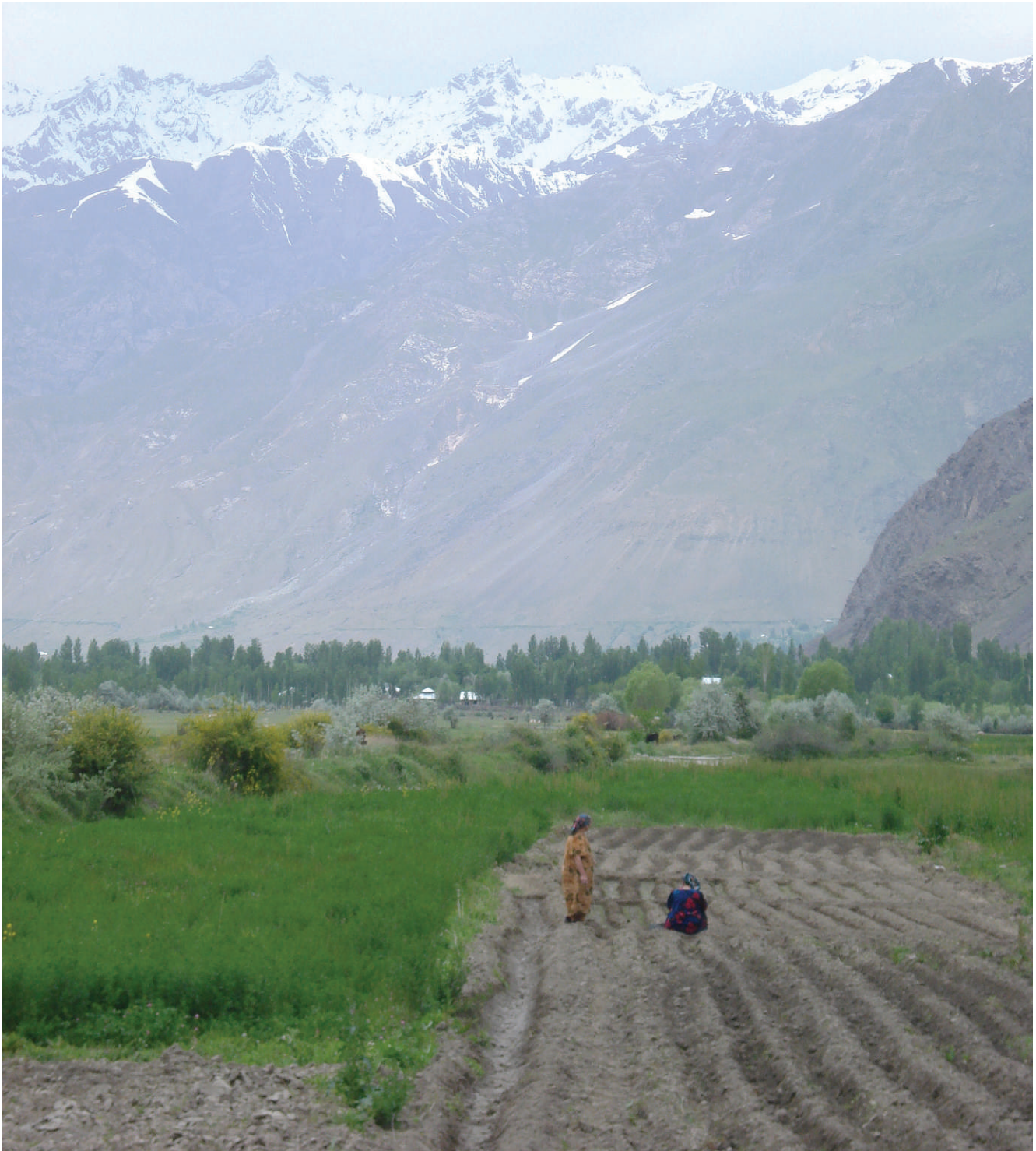
FIGURE 4 Women weeding a field.