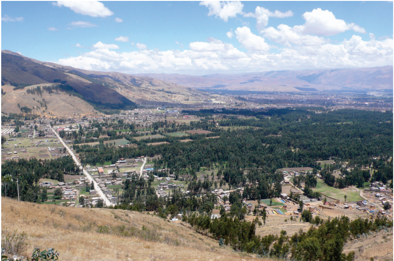
FIGURE 2 Settlement patterns in the lower Shullcas Valley in 2011. The view in this and subsequent figures is toward the south.

valley floor, represents a major challenge to periurban smallholders. Second, the growing demand for lots at the rural–urban fringe is driving speculation, boosting land prices, and thus impeding farmers’ lease of additional parcels, which are needed for the market-oriented production of artichokes, maize, or potatoes (Haller and Bender 2013; Haller 2014). Third, these settlements’ location at the border between 2 agroecological zones—the quechua (from Quechua qheswa , meaning “inhabitants of temperate valleys”) up to 3500 masl and the suní (Quechua for “high,” “large,” or “deep”) and puna (Quechua, meaning “high and cold area”) regions above (Pulgar Vidal 1946; regarding similar zonation models, see Stadel 1992 or Borsdorf and Stadel 2013)—emphasizes the geographic specificities of urban growth impacts on agriculture in tropical Andean valleys.