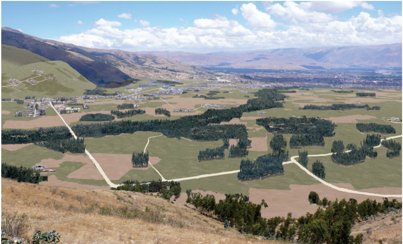
FIGURE 5 Male participants' preferred development scenario. (Photomontage by Florian Einsiedler)

agricultural areas on the orographic right side of the river should be protected, planned settlement on the slopes is considered a potential strategy for conserving irrigated land for food production in the quechua on the valley floor.