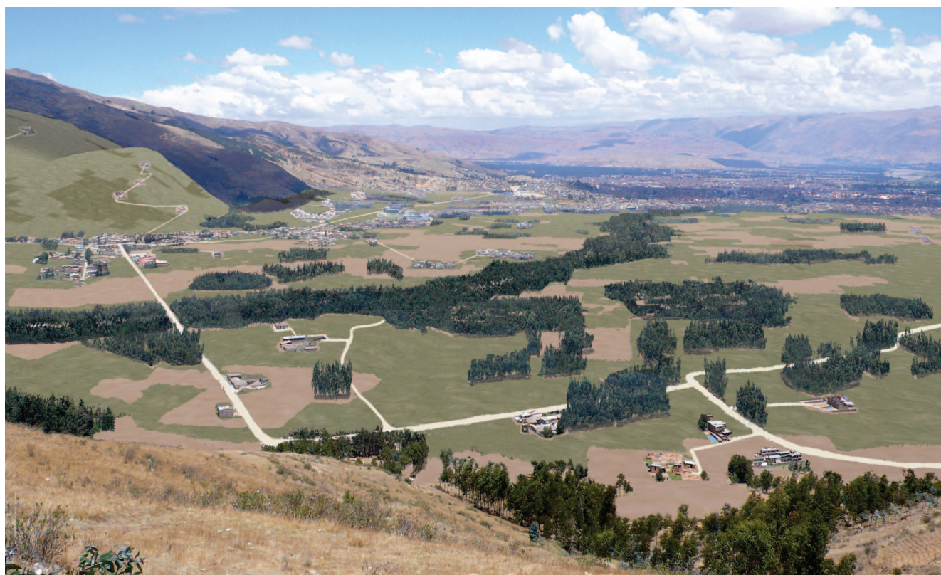
FIGURE 6 Female participants' preferred development scenario. (Photomontage by Florian Einsiedler)

better understanding of differences between the stakeholder groups.