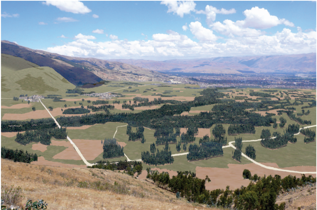
FIGURE 3 Visualization of the lower Shullcas Valley as it appeared in 1988. (Photomontage by Florian Einsiedler)

of the settlements' total population—could be designed. (Regarding gender differences and environmental perceptions, see Mohai 1997, Verma 2014, or, exemplarily, Burger et al 1998.) This included 7 female and 6 male interviewees residing in Uñas, as well as 7 female and 5 male interviewees residing in Vilcacoto.