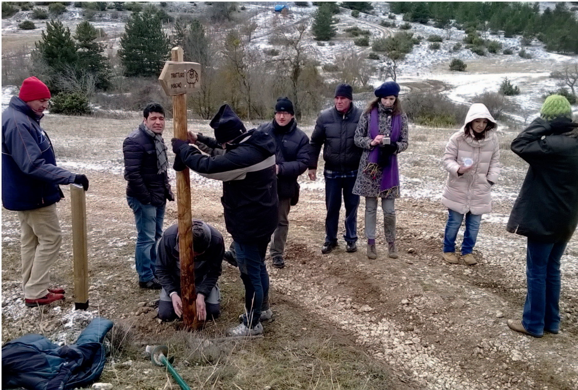
FIGURE 5 Members of a local community group erecting handmade wooden signs outside the mountain village of San Demetrio Ne' Vestini on the Tratturo Magno path. The village mayor is second from left. The shorter post displays a QR code to access information about the site.

Tratturo Magno project outcomes, especially in relation to the need to better manage the restored path and local cultural and natural heritage. These discussions, which were continued in the fourth phase of the SIA Framework for Action, resulted in the creation of a legal entity, the network agreement Landscapes in Transhumance.