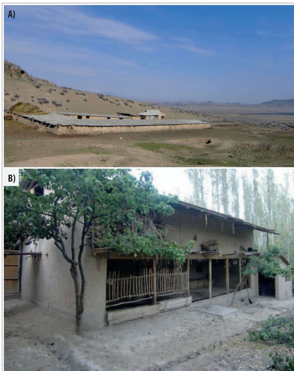
FIGURE 2 (A) The winter shed of a large-herd owner on the winter pasture site; (B) a herder's winter shed on his household plot. (Photos by Munavar Zhumanova, fieldwork 2014–2015)

socioeconomic and individual-level differences between both groups are presented in Table 1.