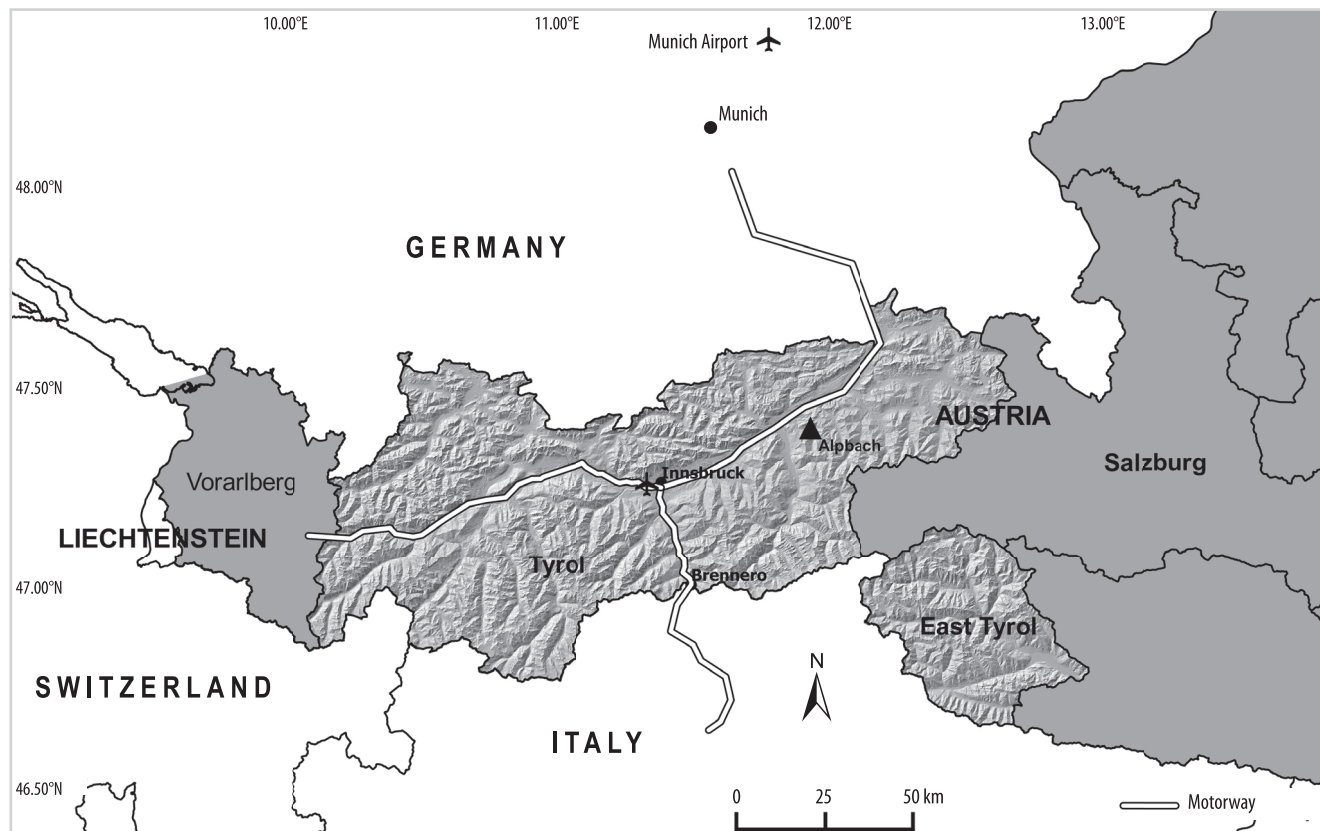
FIGURE 1 Location of Alpbach and the 2 nearest airports, Munich and Innsbruck. (Map by Rainer Unger)

Alpbach, we calculated the total amount of person kilometers traveled (PKT), based on the distances from the visitor hubs to Alpbach, for 4 modes of travel (private vehicle, bus, train, and airplane).