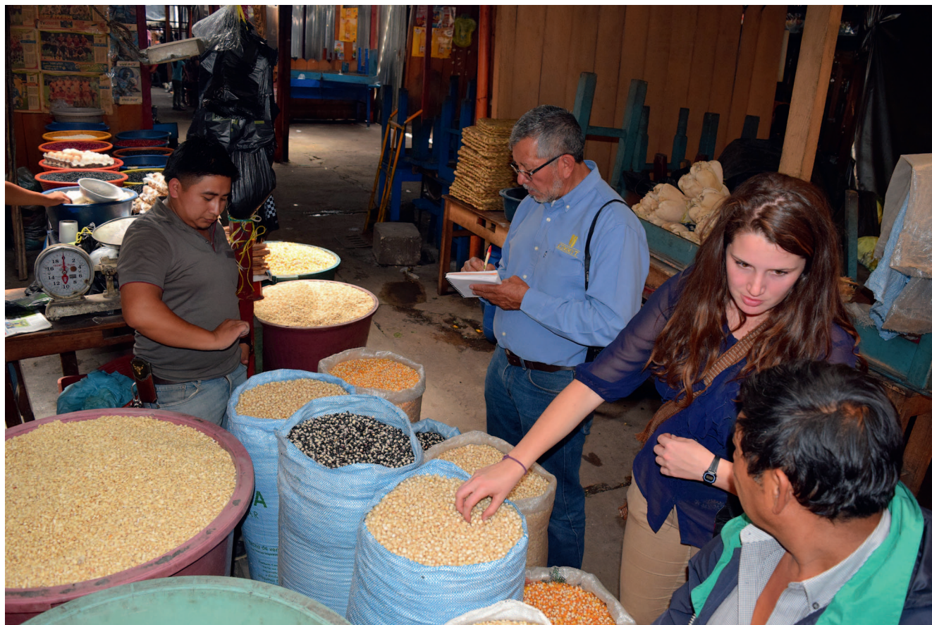
FIGURE 5 Native and improved maize varieties at the Chichicastenango market.

department in the north of Guatemala). Maize from El Petén is largely consumed in that region, and most of the maize purchased in the western highlands originates in Mexico.