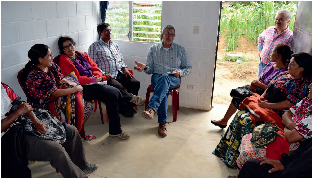
FIGURE 3 Focus group meeting in the department of Quiché.

farming systems in the region. Topics included family size, landholding size, maize production, maize consumption, and how farmers cope with maize deficits.