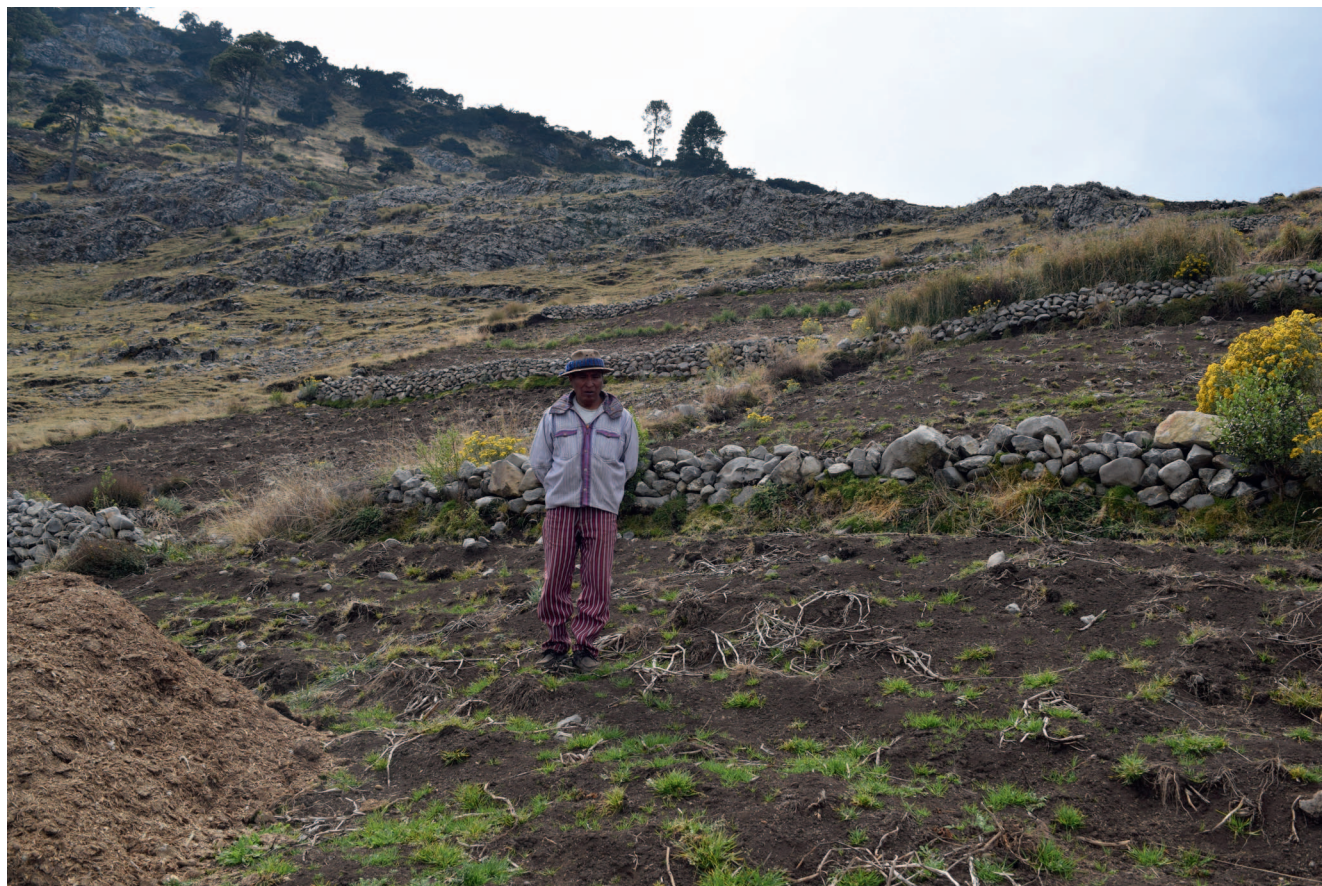
FIGURE 1 Maize farmer in the department of Huehuetenango. The farmer's plot is typical of those in the western highlands of Guatemala in terms of its small size, rocky soil, and steep slopes

interrelated and systemic ways. ... Without means to address these patterns systemically, violent social conflict will likely continue to escalate, undermining overall development in the Western Highlands” (Democracy International 2015: i).