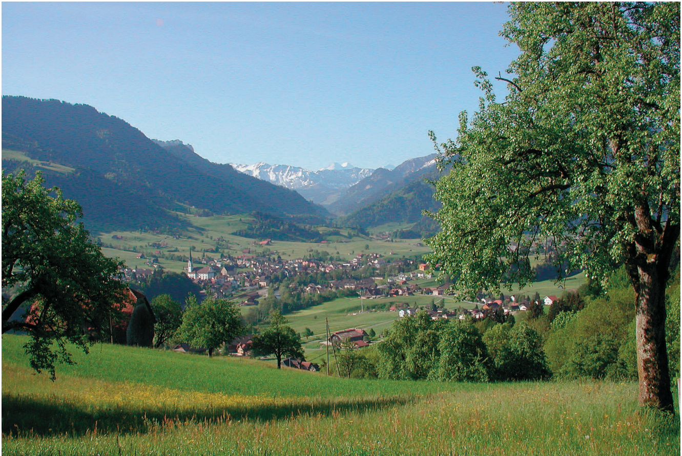
FIGURE 2 Schüpfeim, the main settlement of the UNESCO BRE, with the first alpine chains in the background.