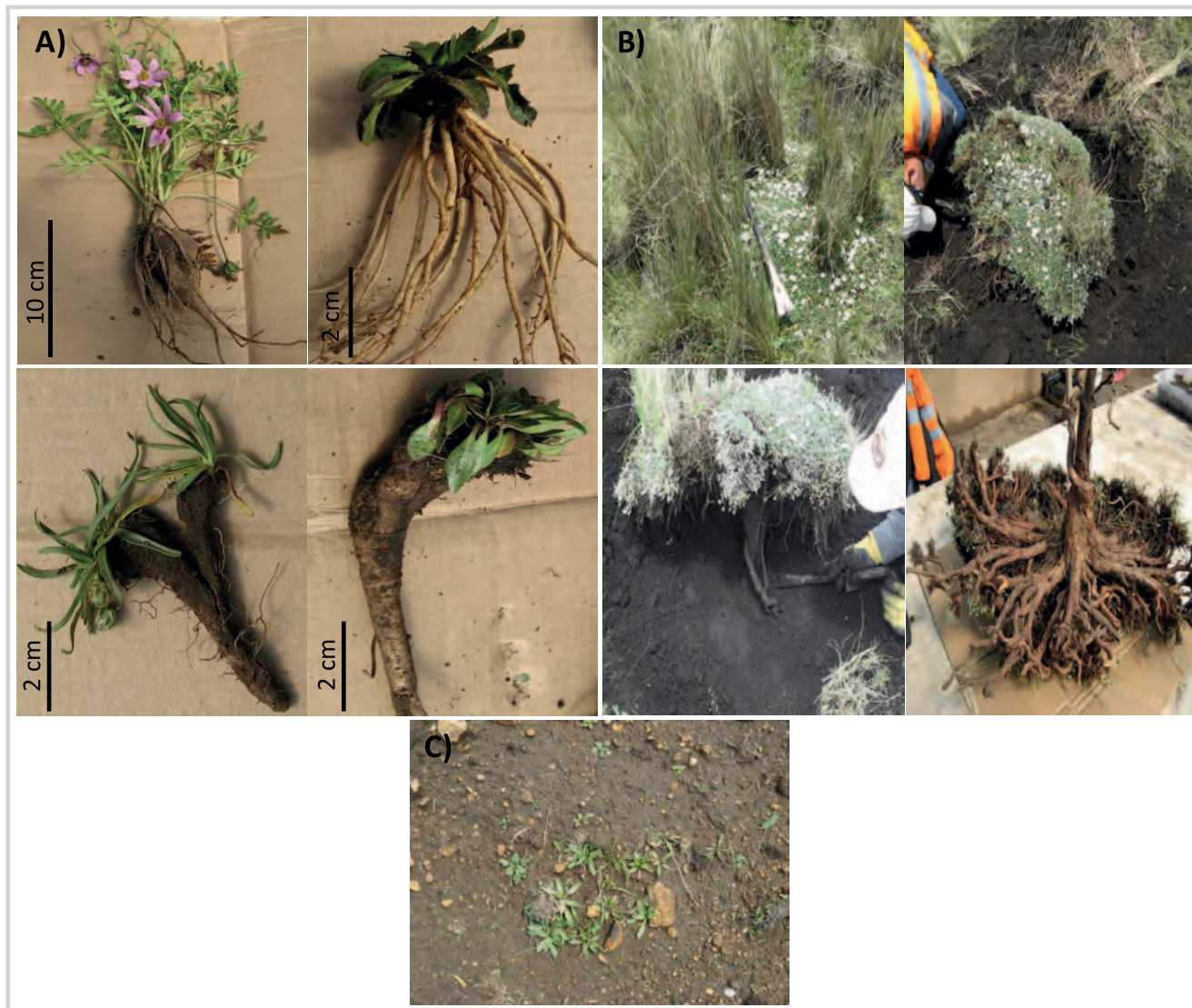
FIGURE 1 (A) Observation in the field suggests that resprouting capacity from underground storage organs is common on the Peruvian Altiplano. (B) A species from the Nototriche genus (Malvaceae family), in which resprouting is an ancient trait for long-term persistence. To casual inspection, these plants look like insignificant annual herbs. However, when excavated it becomes apparent that these plants may be very old (perhaps 800 years old) and that they are heavily reliant on resprouting from underground storage organs for their persistence. (C) The surface of a recently created topsoil storage pile for a new mine on the Peruvian Altiplano. This photograph shows that resprouting can occur when topsoil is redeployed immediately, but only in the superficial layer of the pile. Rhizomes buried deep within the topsoil pile will putrefy after a year or two.

rhizomes buried underground, which reveals an adaptation to harsh conditions such as pronounced seasonality.