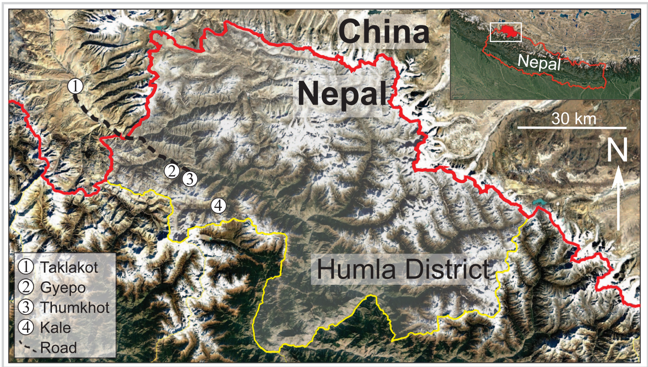
FIGURE 1 Map of upper Humla district and the location of the first road.

We used a mixed-methods approach to assess the 4 dimensions of food security (availability, access, utilization, and stability). Participant observation and unstructured interviews served as a method to better understand both food availability and stability . The first