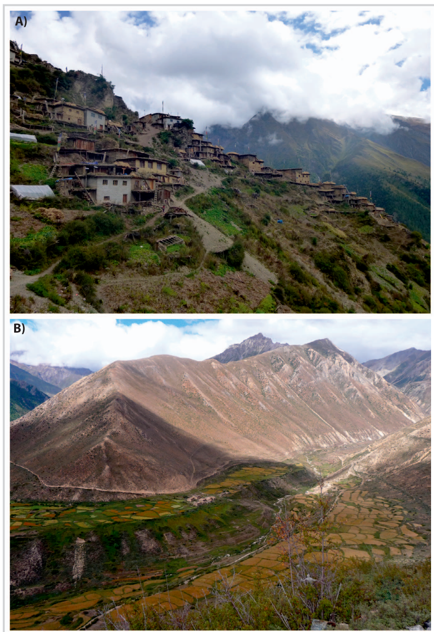
FIGURE 2 (A) The steep topography of Kale village; (B) the flat topography of Gyepo village.

knowledge of Humli food consumption patterns and previous ethnographic accounts of the region (Bishop 1990; Citrin 2012). Our questionnaire included all of the foods that an individual in Gyepo or Kale has the opportunity to eat (see Grocke 2016 for more details). We administered this questionnaire to all households twice, with the person responsible for cooking the majority of the meals. We asked respondents whether they had consumed each of the foods/drinks on the list during the last 3 months, and if so, how often. To gauge consumption